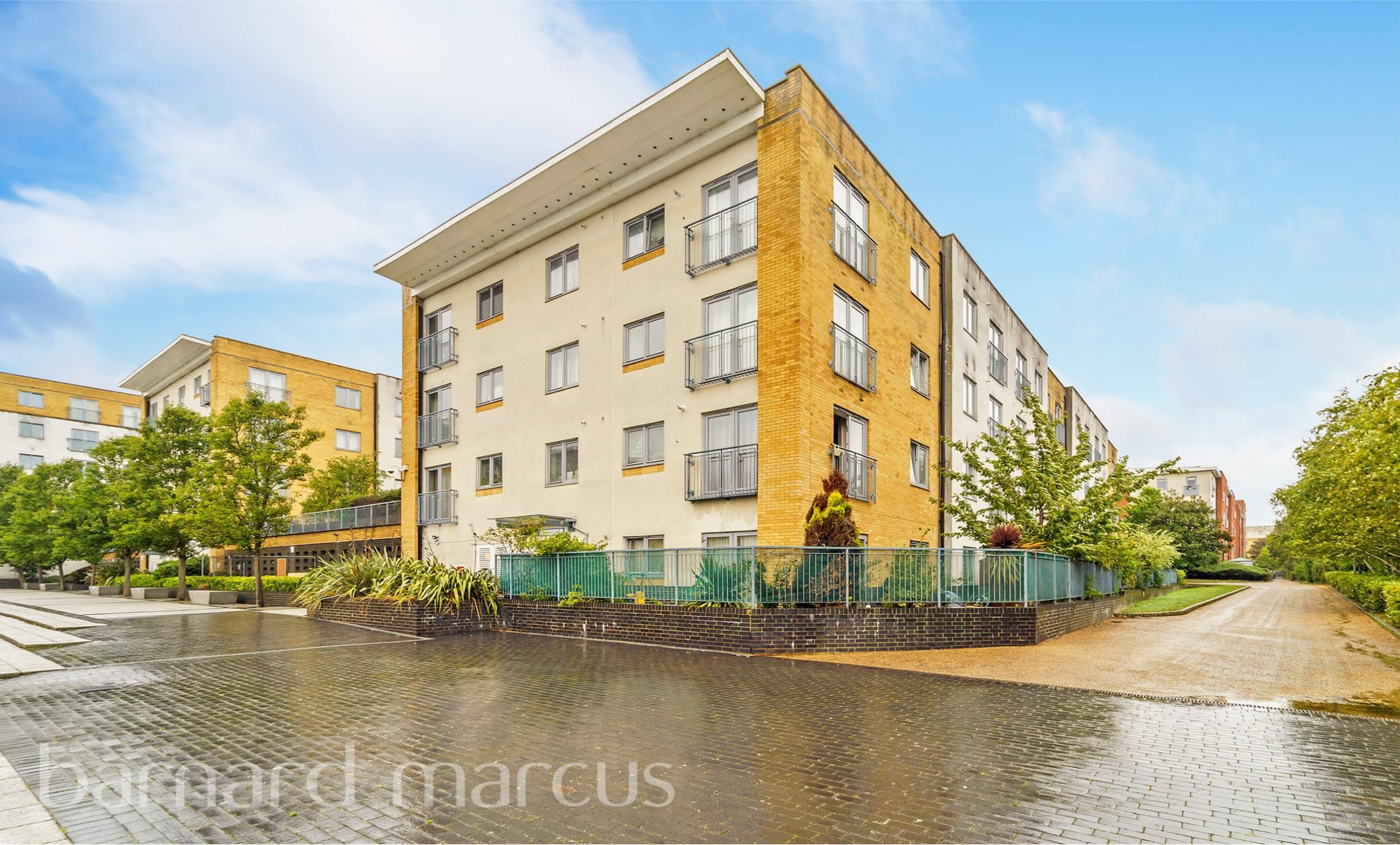
Middlewich House, Taywood Road, Northolt, UB5 6GF