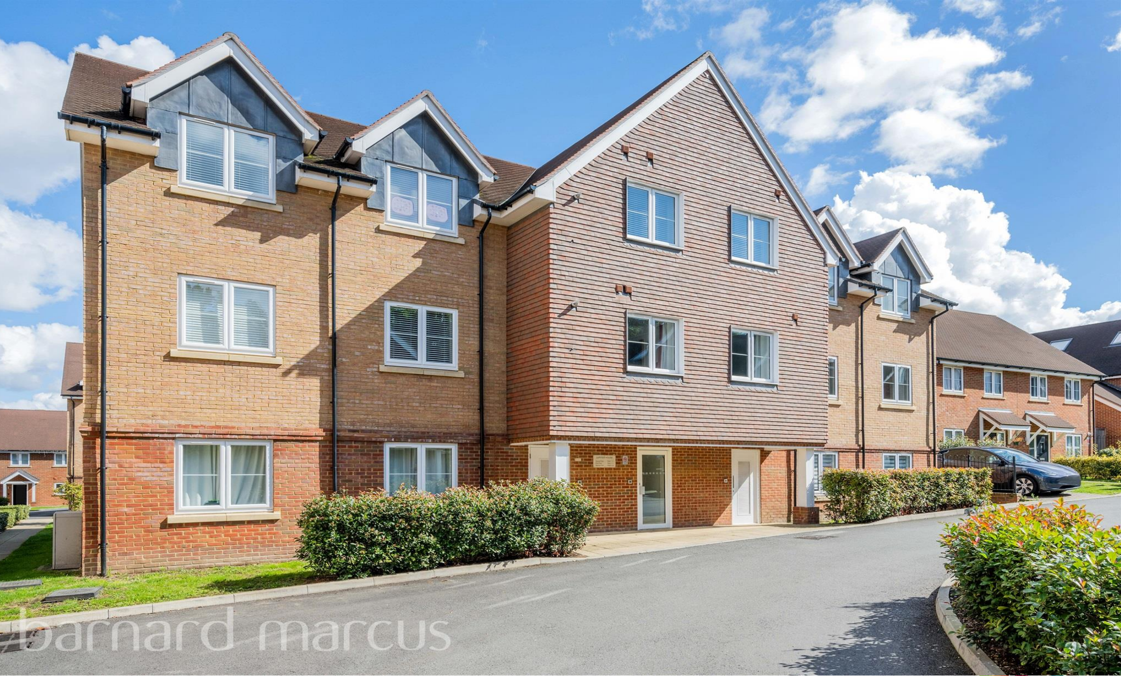
Jupiter House Ceres Crescent, EPSOM KT17 1FH