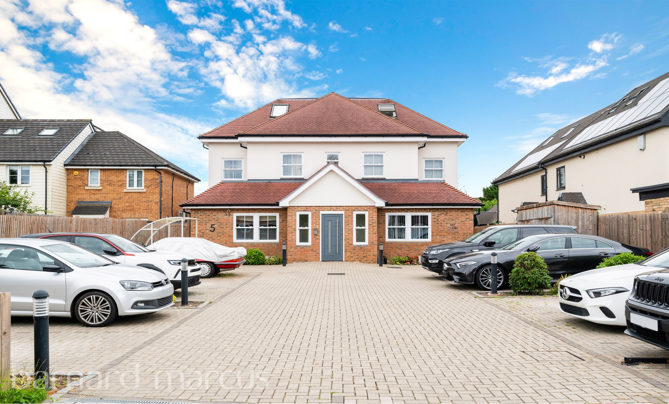
Lily Court Cox Lane, Epsom KT19 9FU