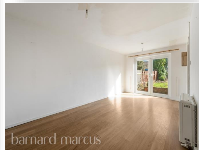
Chavercroft Terrace, Epsom KT18 5TS