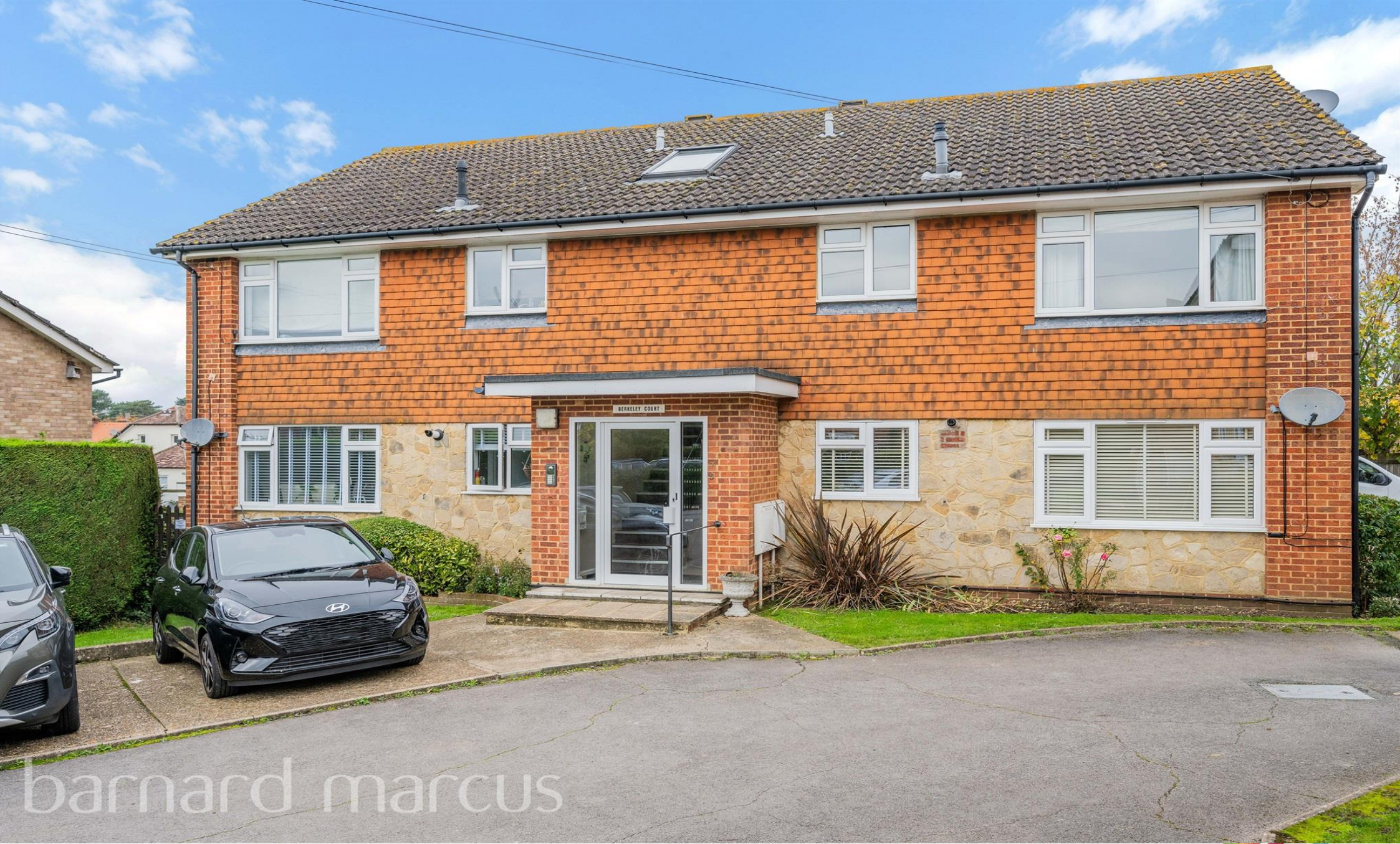
Berkeley Court, Albert Road, Ashted, KT21 1BJ