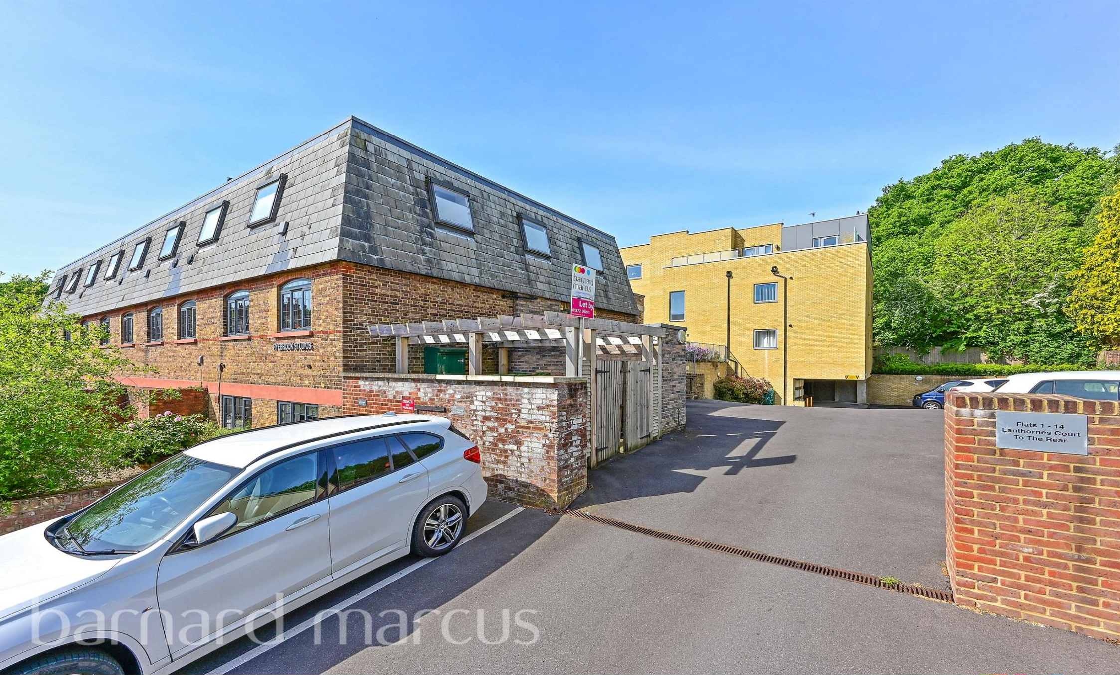
Ryebrook Studios, Woodcote Side, Epsom, KT18 7HD