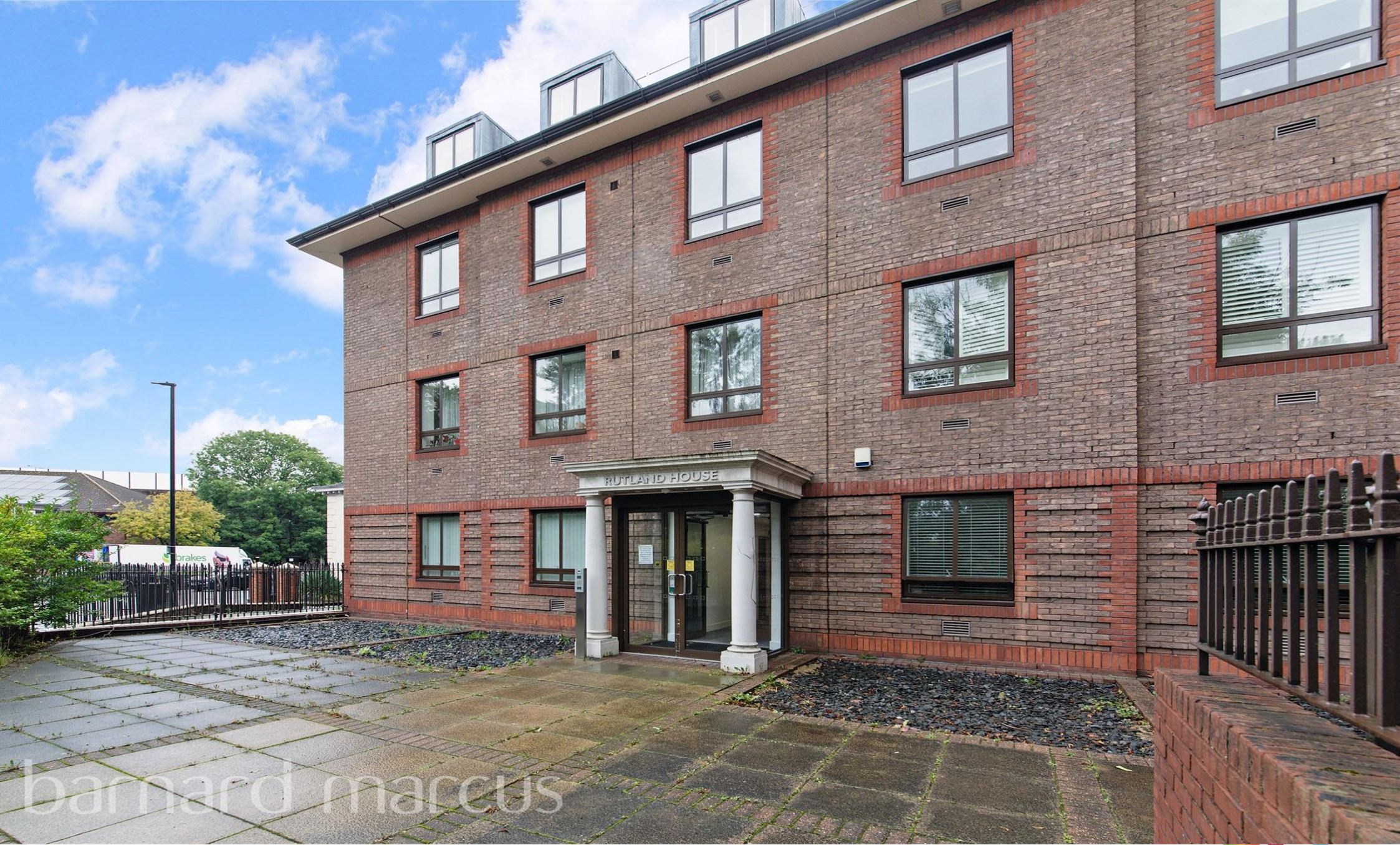
Rutland House, South Street, Epsom, KT18 7EZ