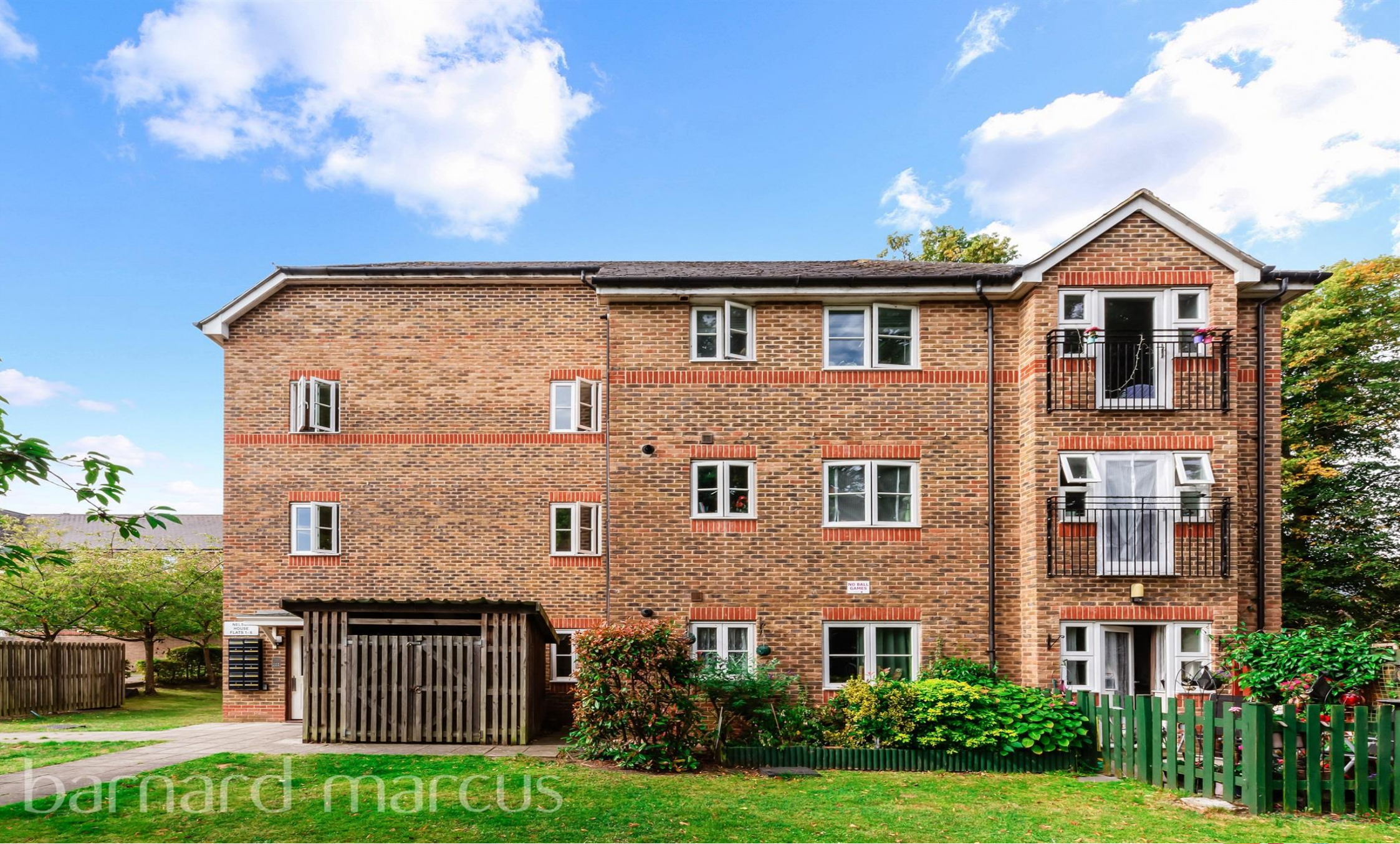
Nelson House, Westcote Road, Epsom, KT19 8GG