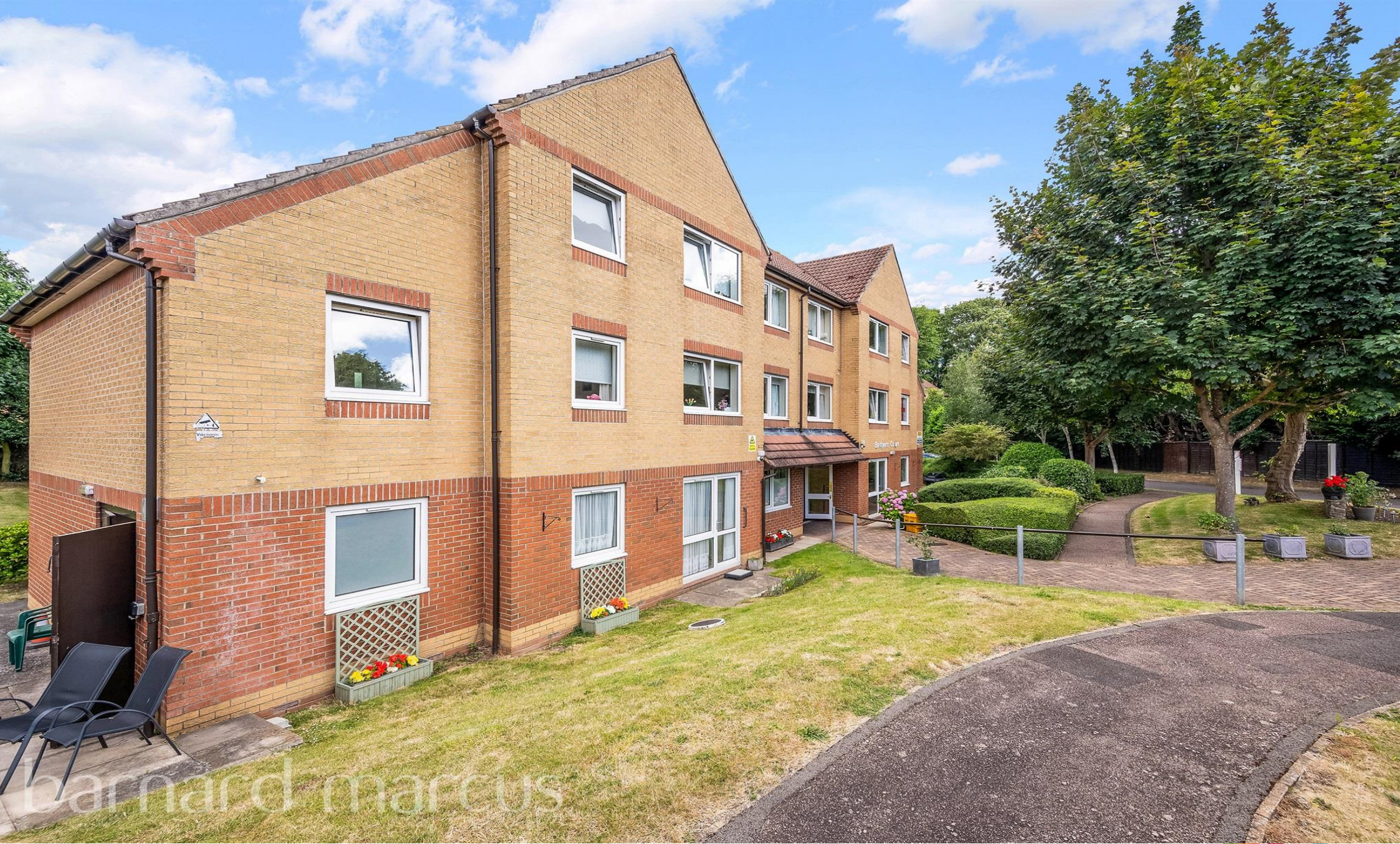
Badgers Court, The Grove, Epsom, KT17 4JW