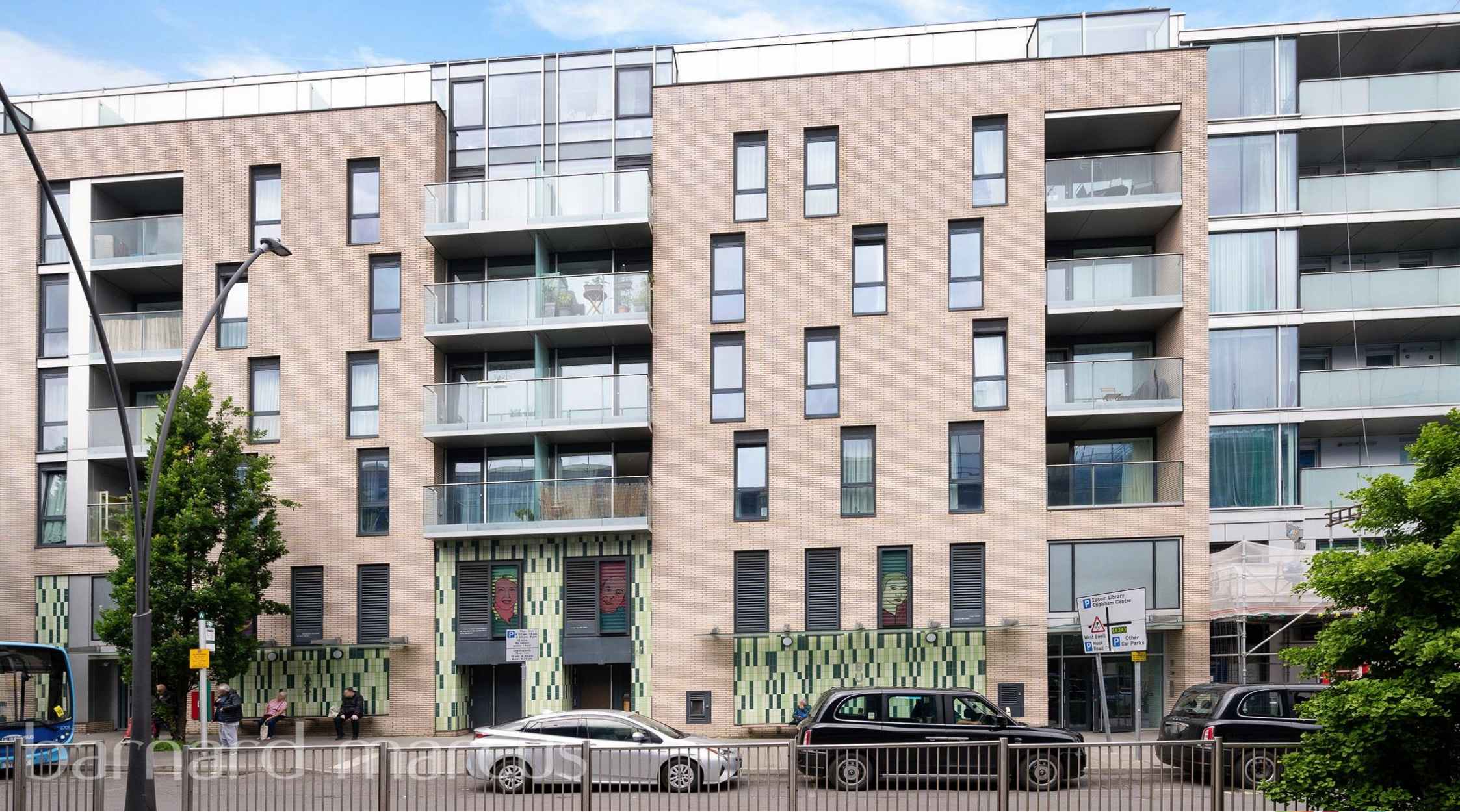
Jubilee House, Station Approach, Epsom, KT19 8EU