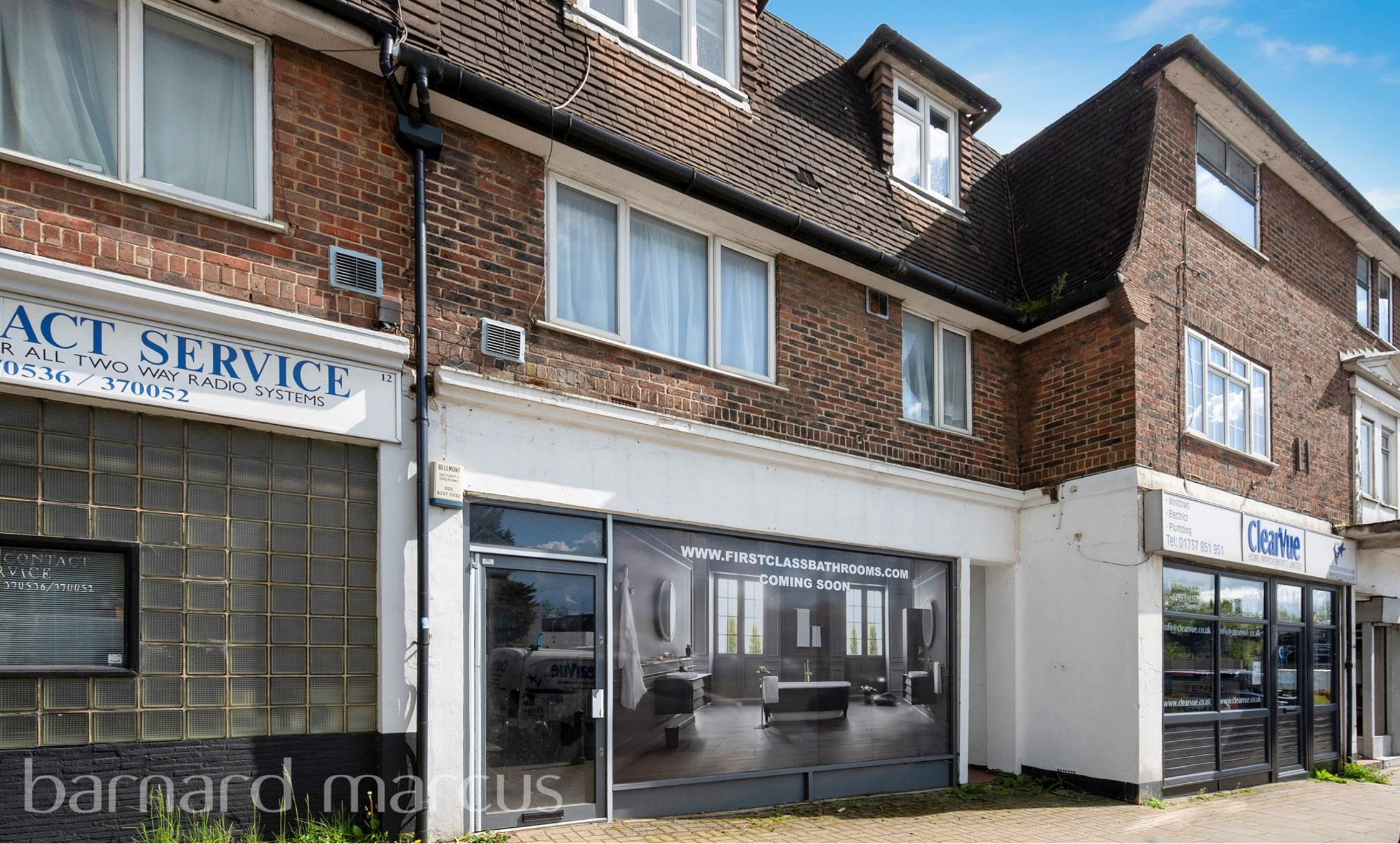
The Parade, Burgh Heath, Tadworth, KT20 6AT