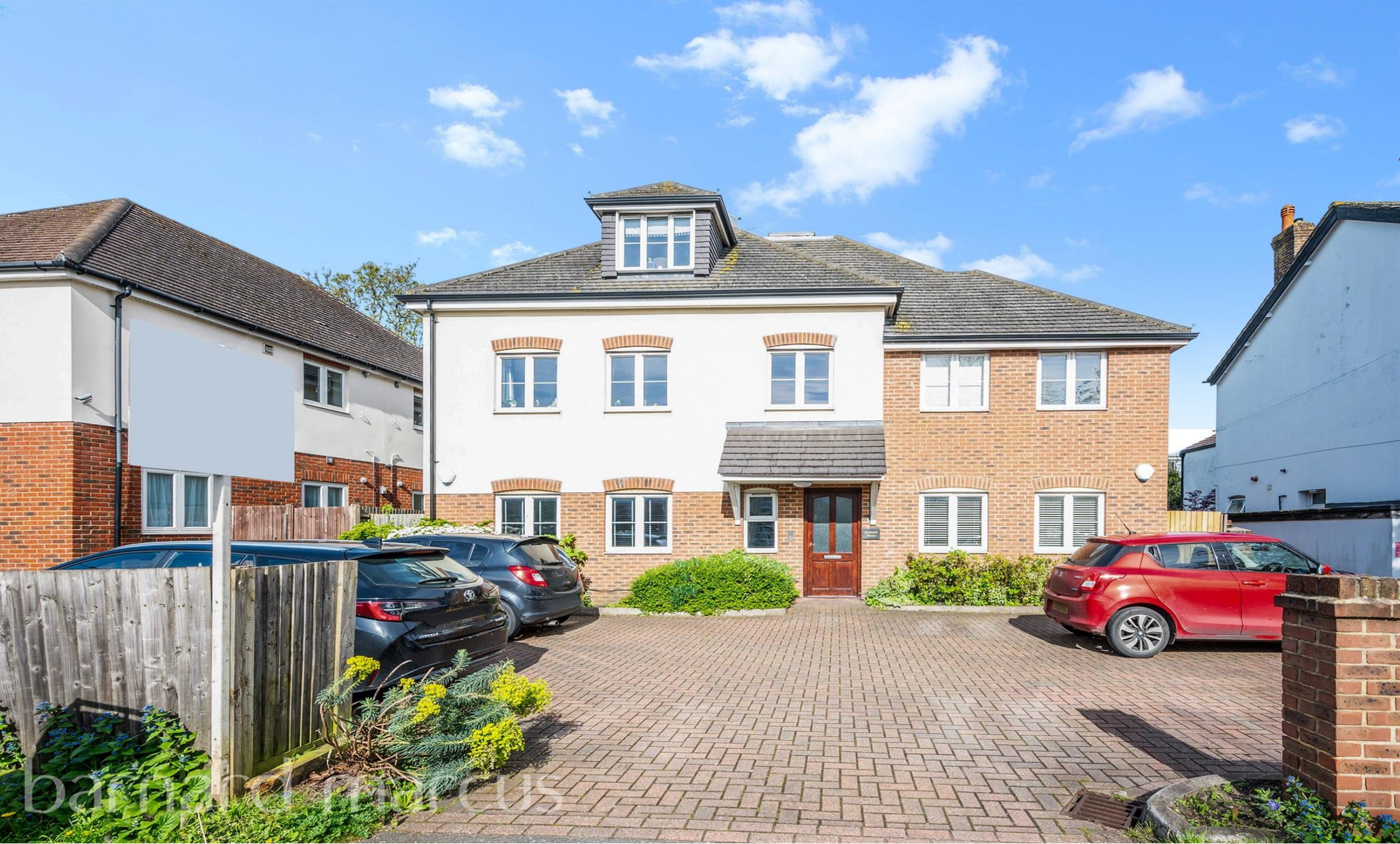
Eswarah House, Epsom Road, Epsom, KT17 1JQ