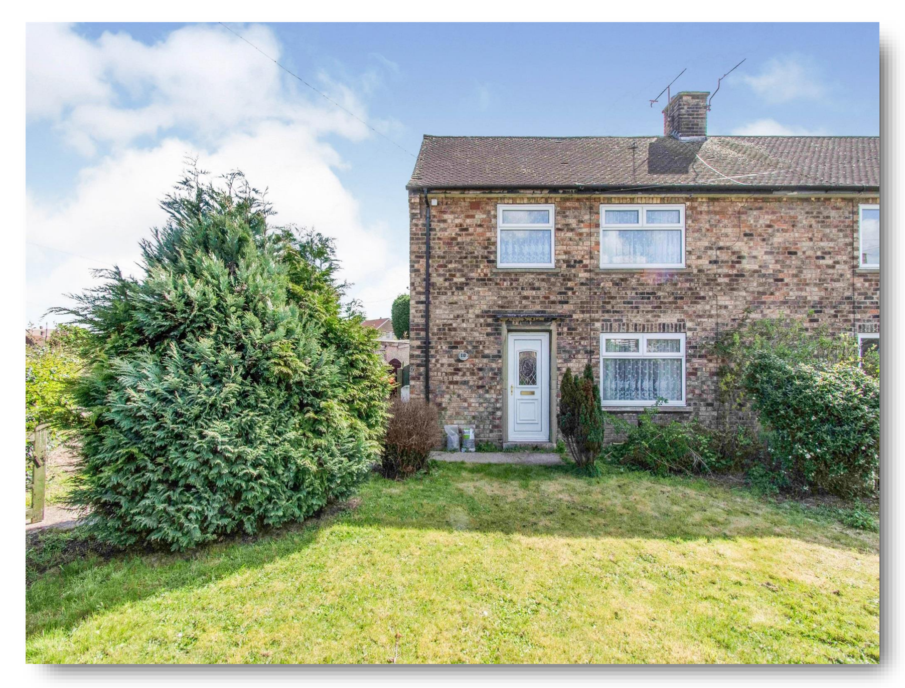
Sandrock Road, Harworth Doncaster DN11 8PG