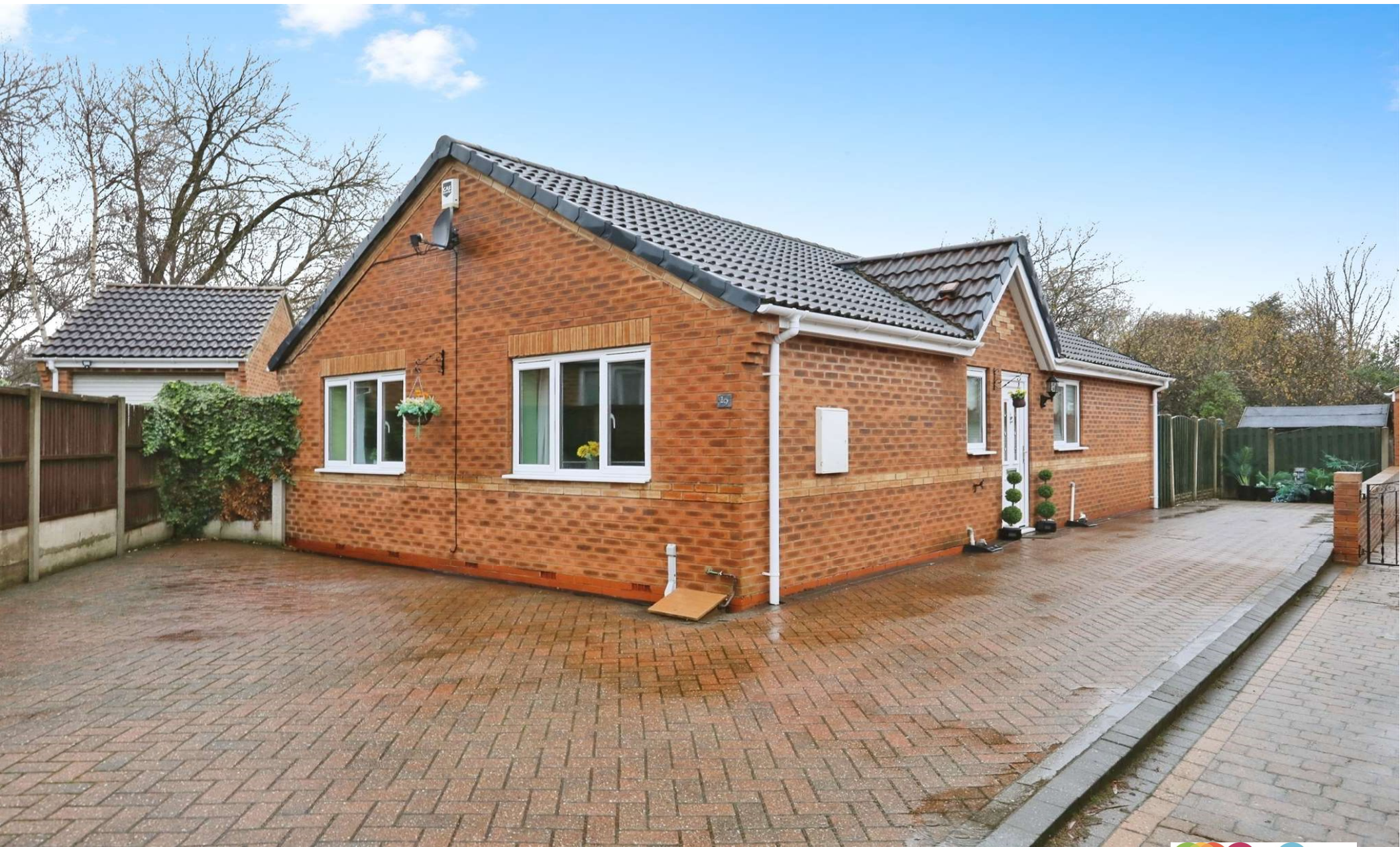
Herriot Grove, Bircotes Doncaster DN11 8ET