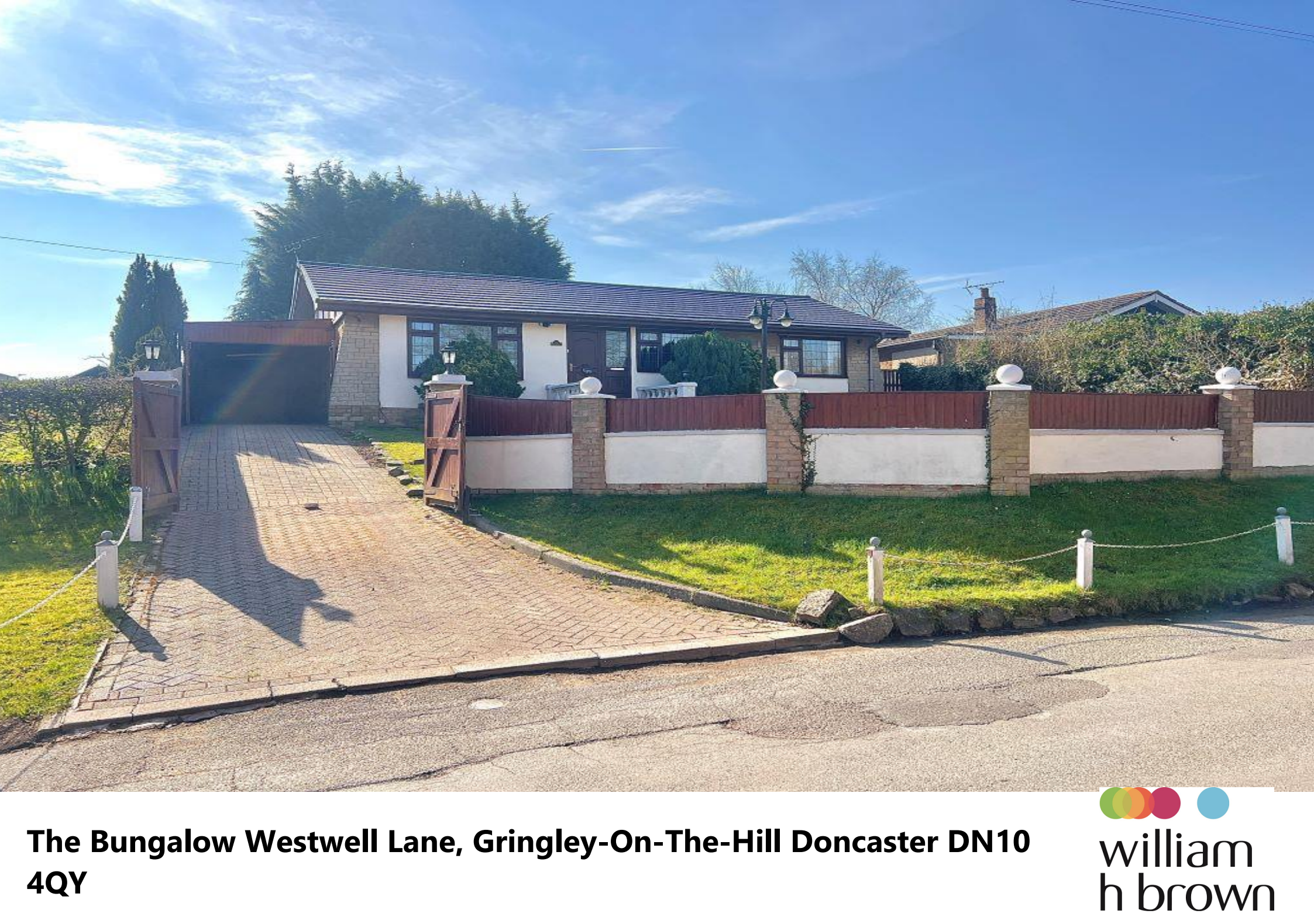
The Bungalow Westwell Lane, Gringley-On-The-Hill Doncaster DN10 4QY