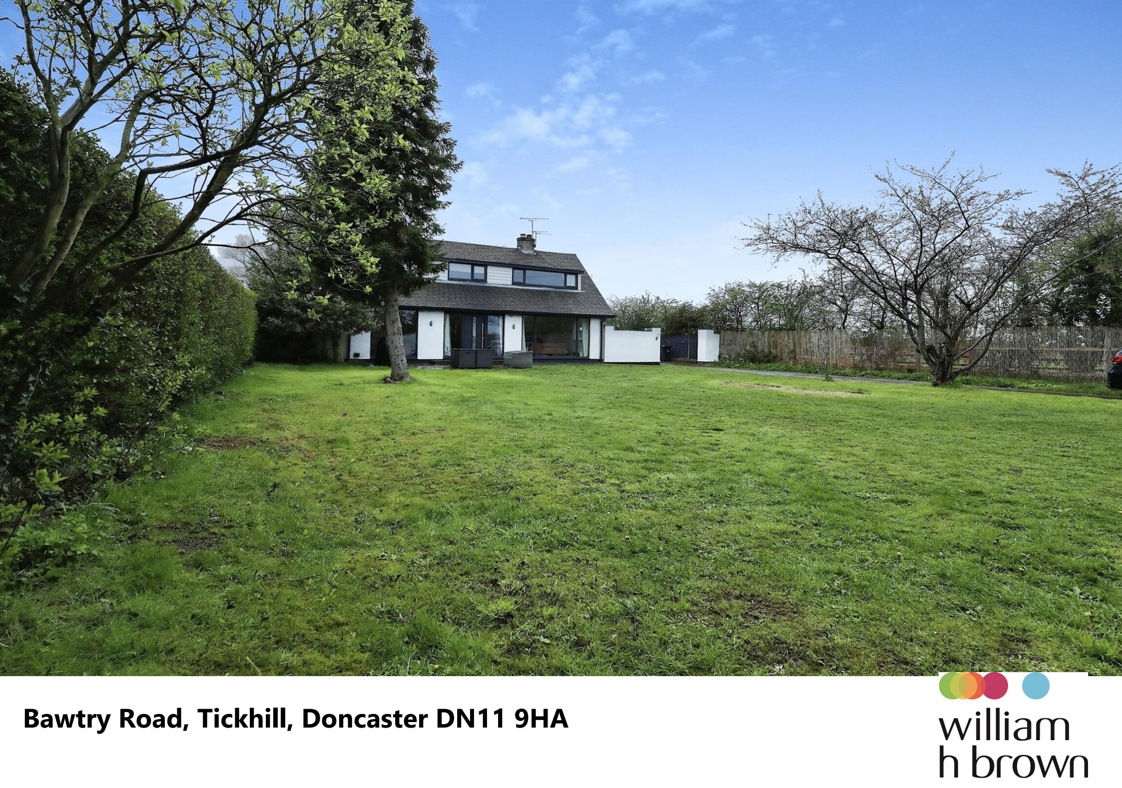
Bawtry Road, Tickhill, Doncaster DN11 9HA