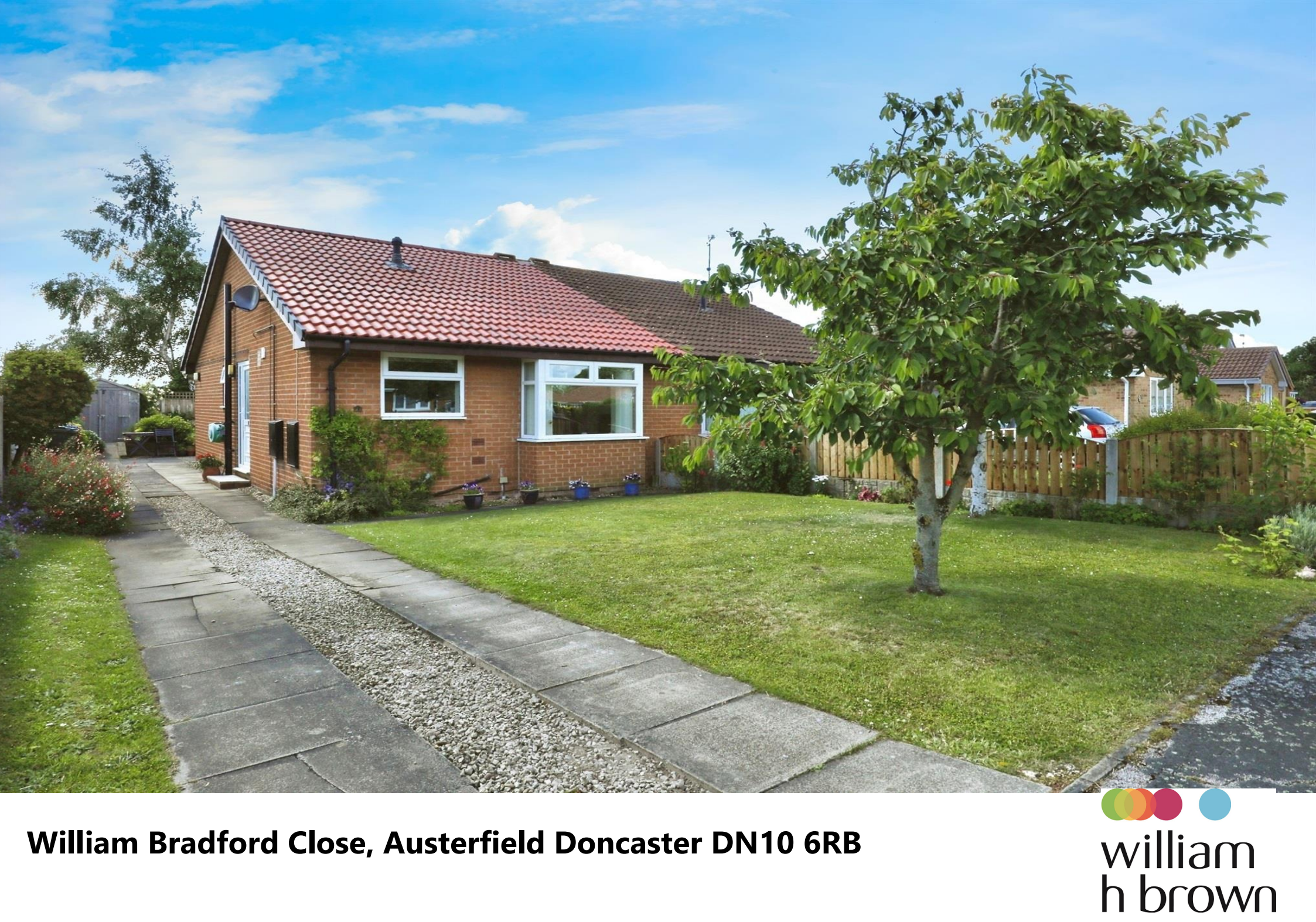
William Bradford Close, Austerfield Doncaster DN10 6RB