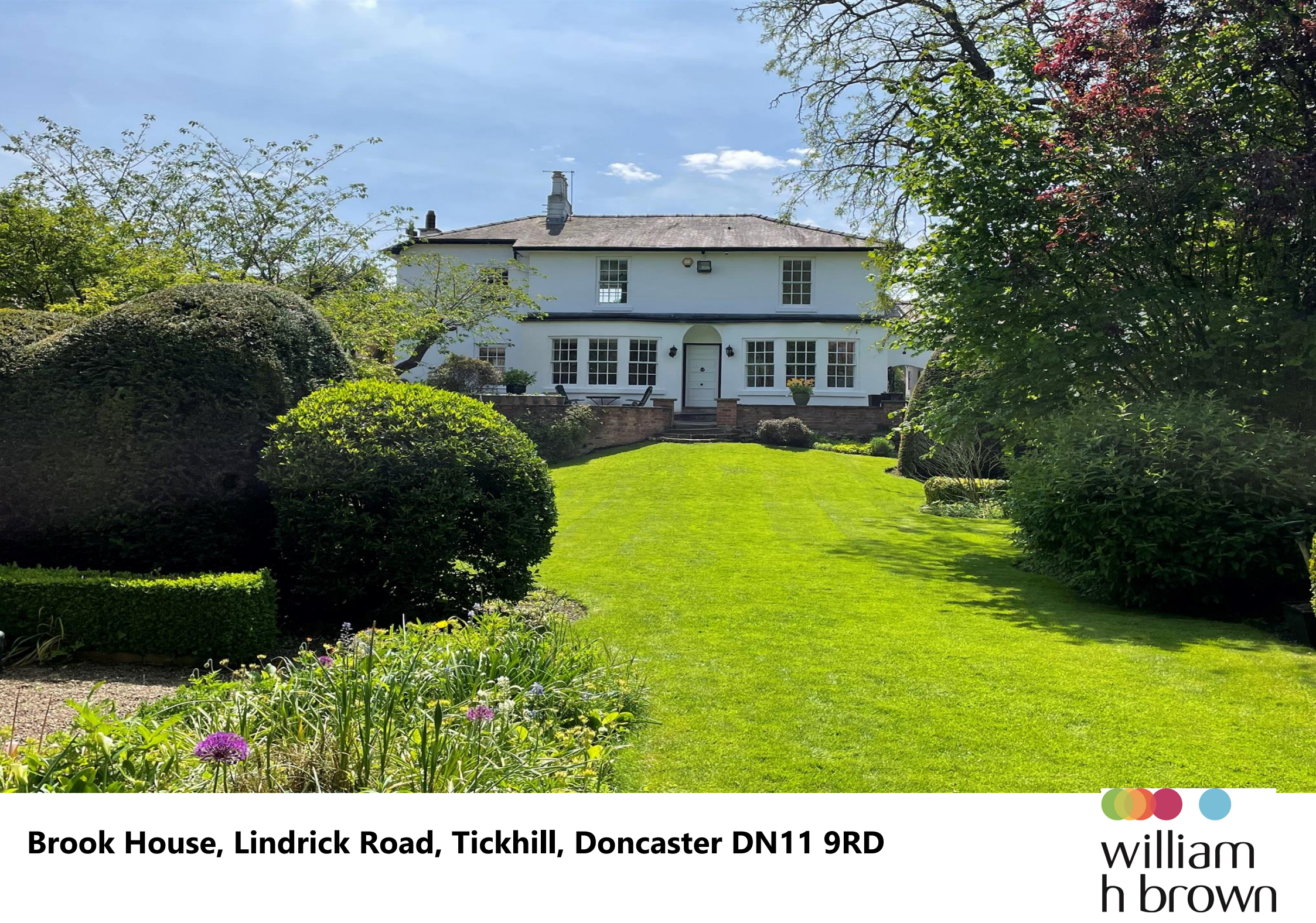
Brook House, Lindrick Road, Tickhill, Doncaster DN11 9RD