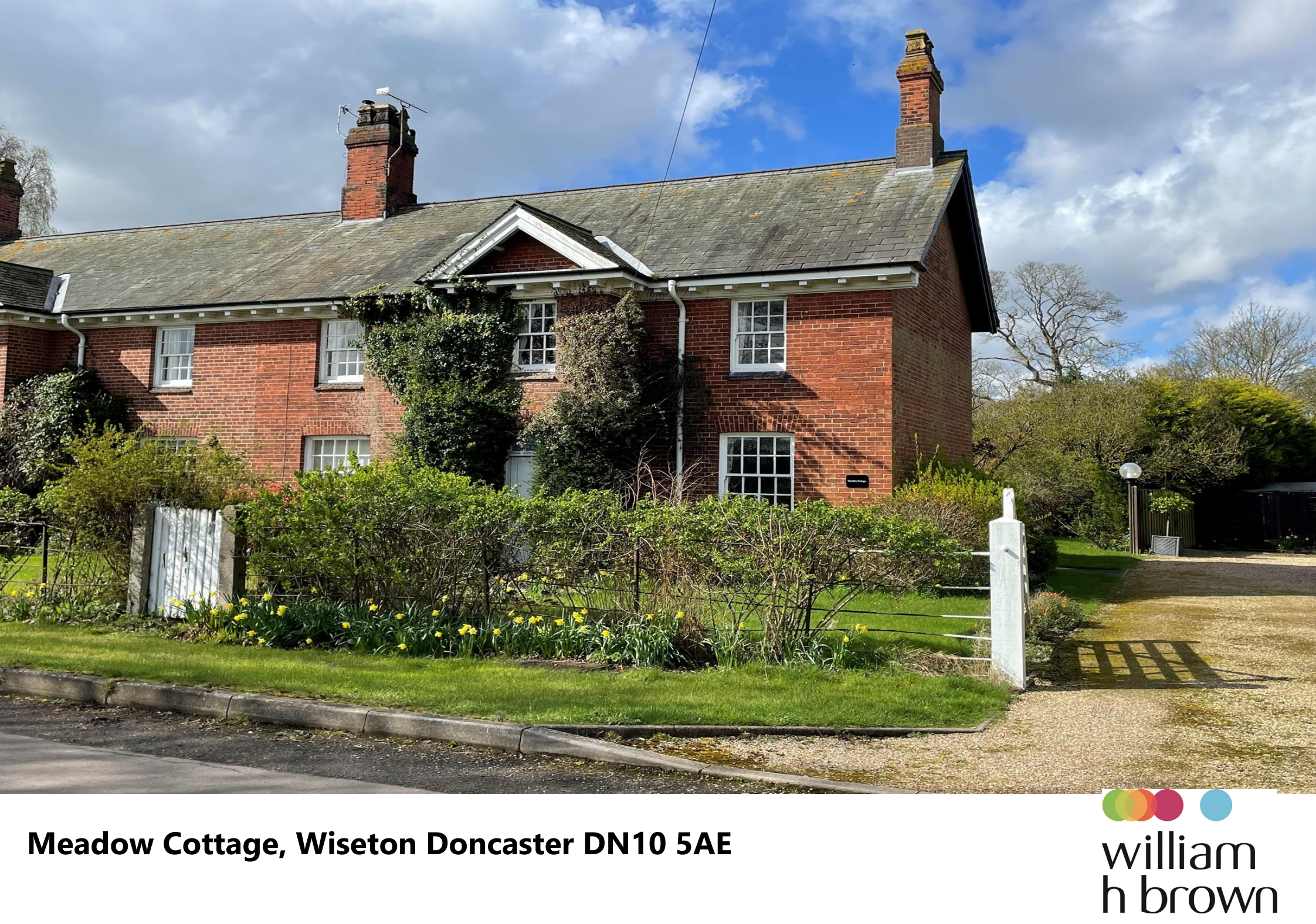
Meadow Cottage, Wiseton Doncaster DN10 5AE