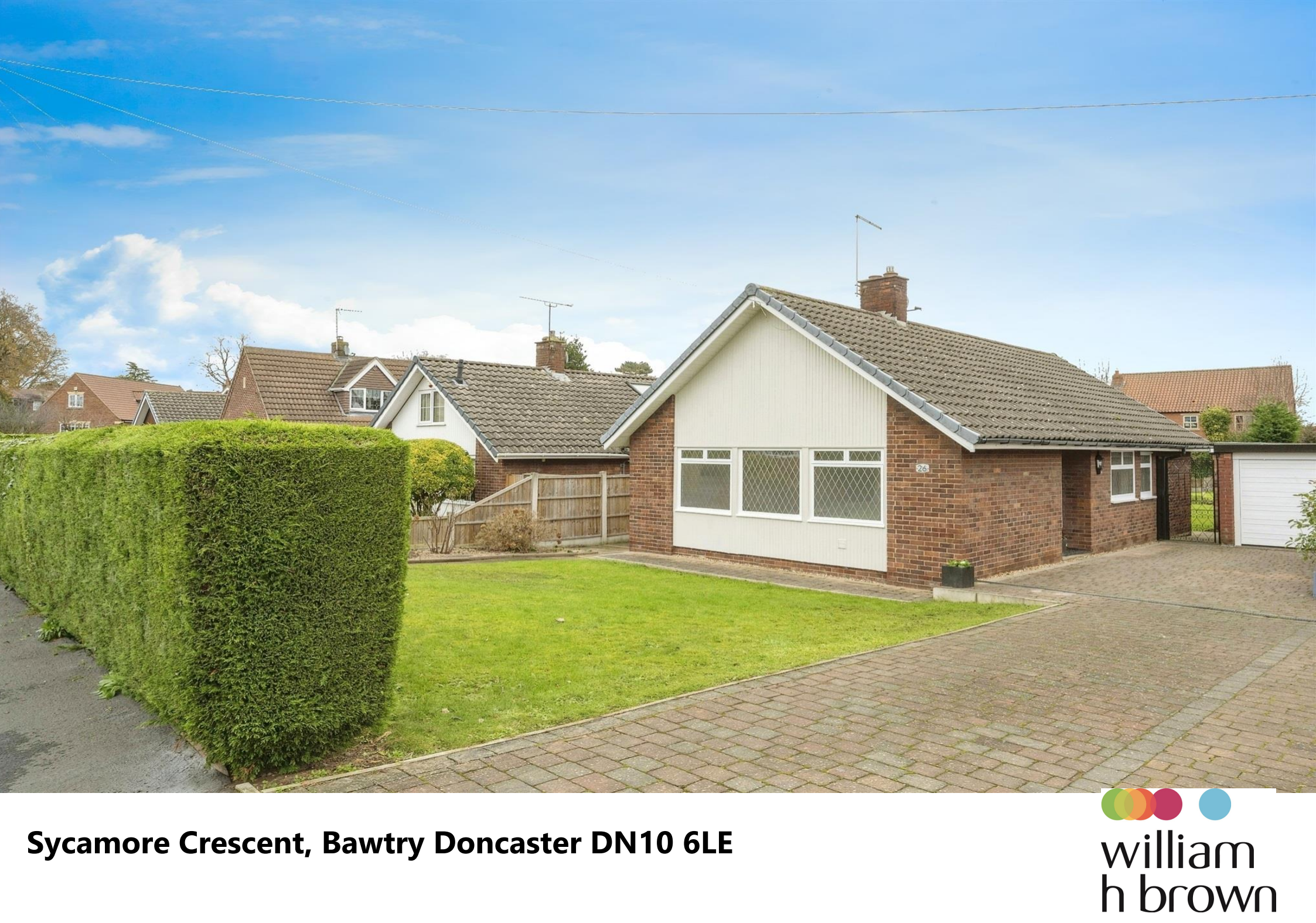
Sycamore Crescent, Bawtry Doncaster DN10 6LE