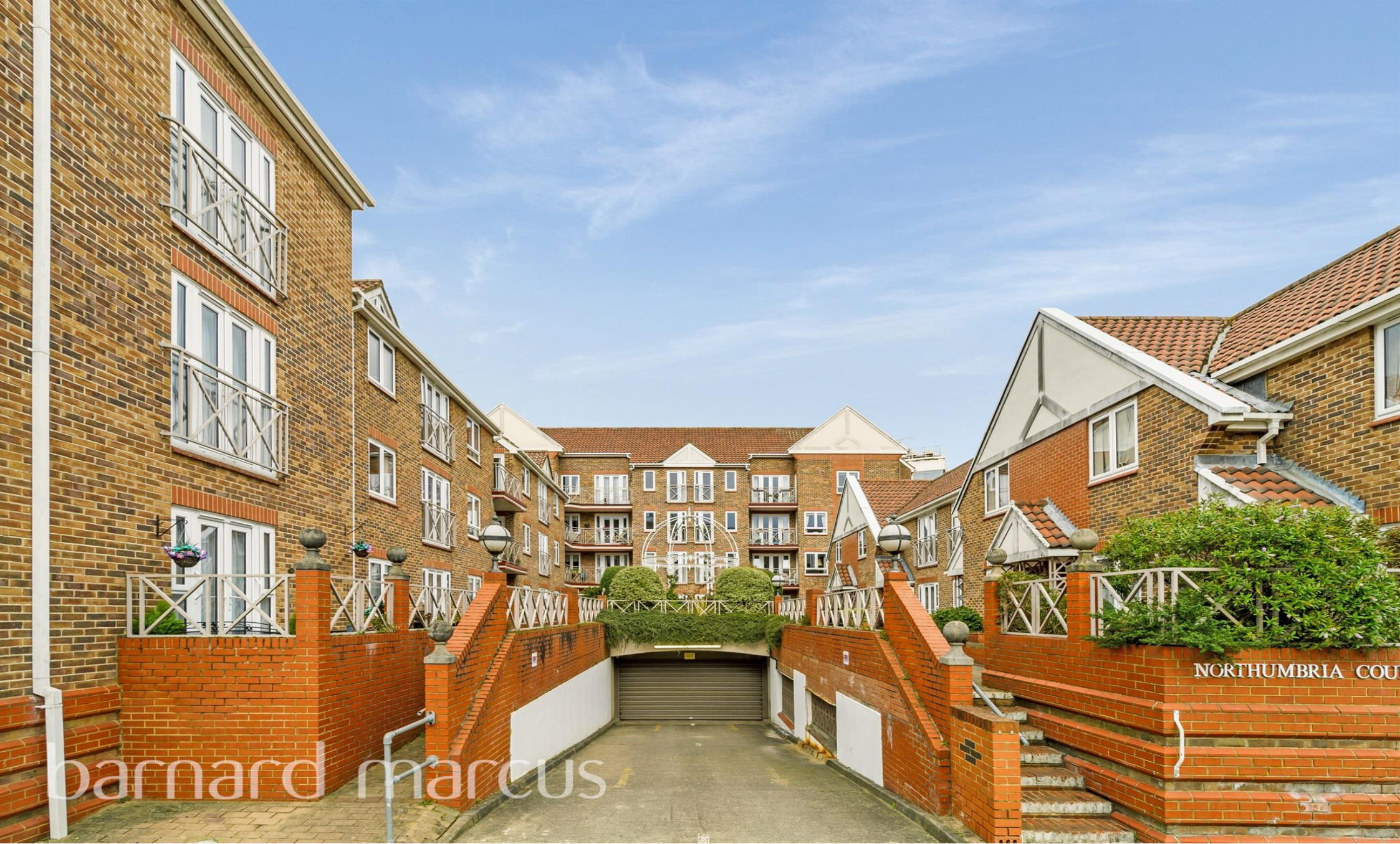
Northumbria Court Sheen Road, Richmond TW9 1AE