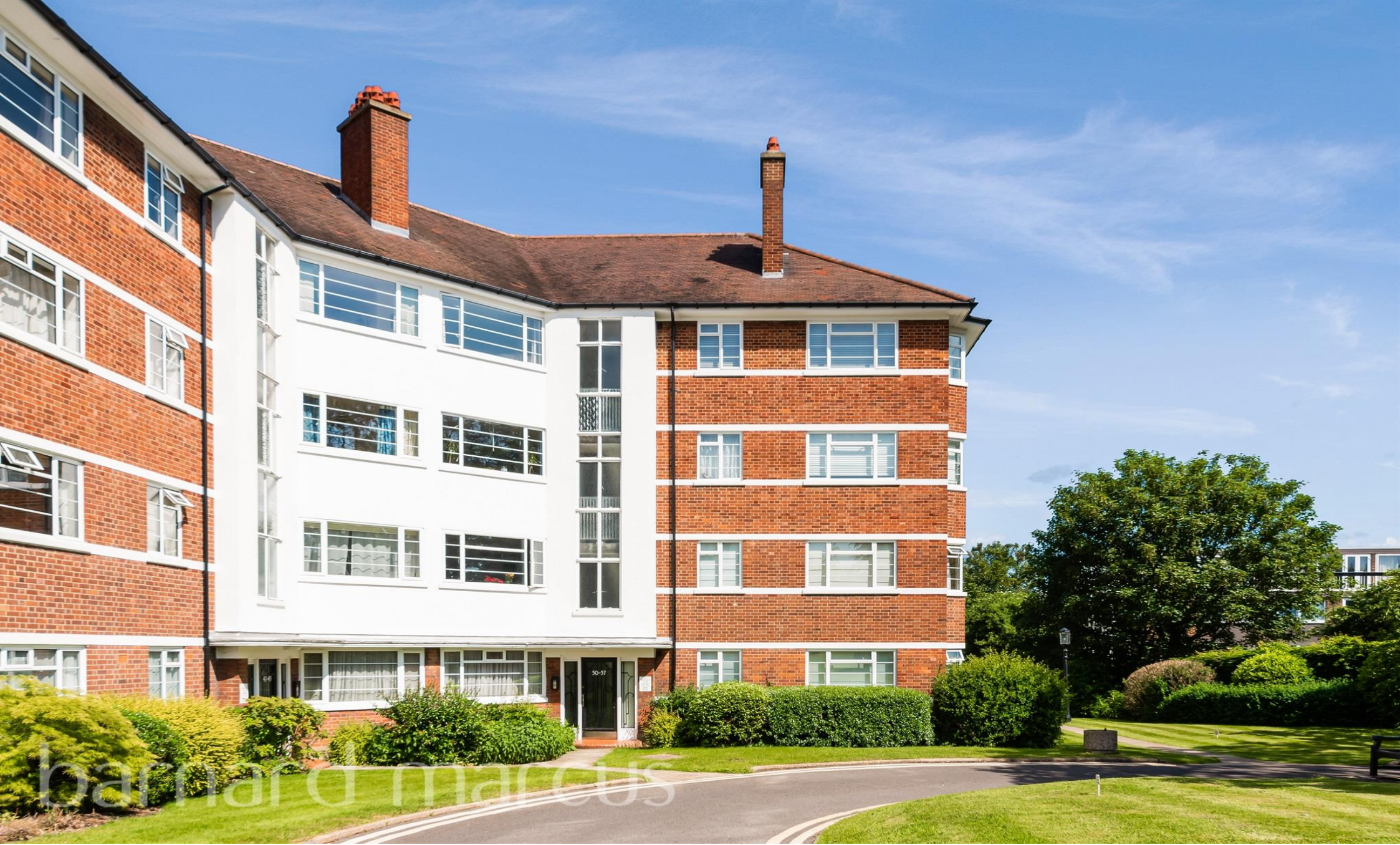
Deanhill Court, London SW14 7DL