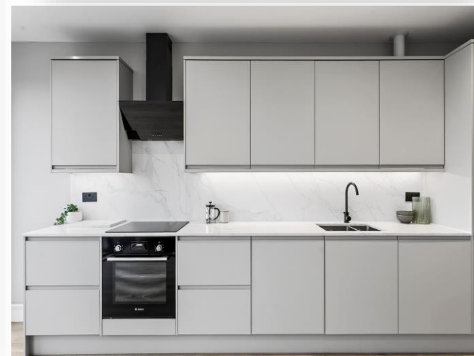
Foundry House, Elm Grove, London SW19 4HE