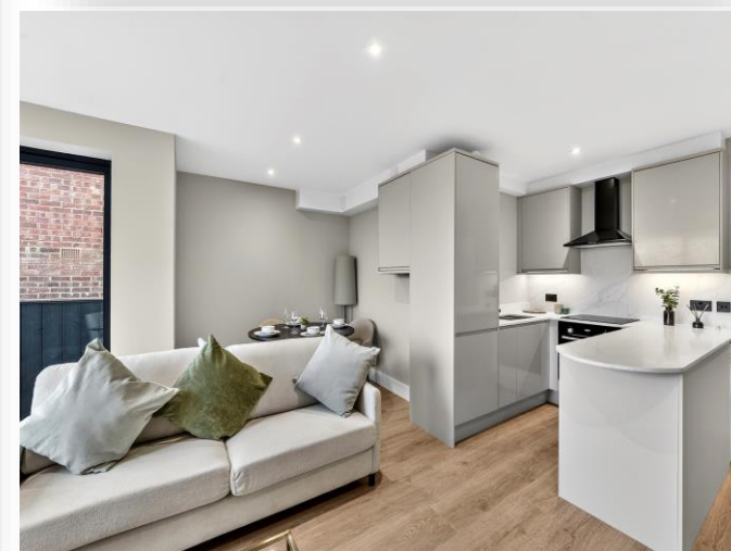
Foundry House, Elm Grove, London SW19 4HE