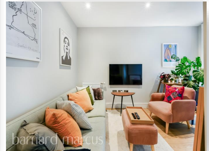
Keel Apartments, Greyhound Parade, London SW17 0GY