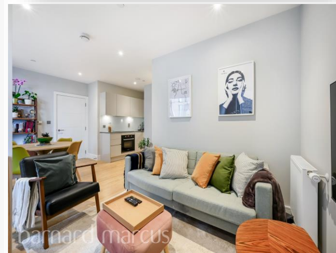
Keel Apartments, Greyhound Parade, London SW17 0GY