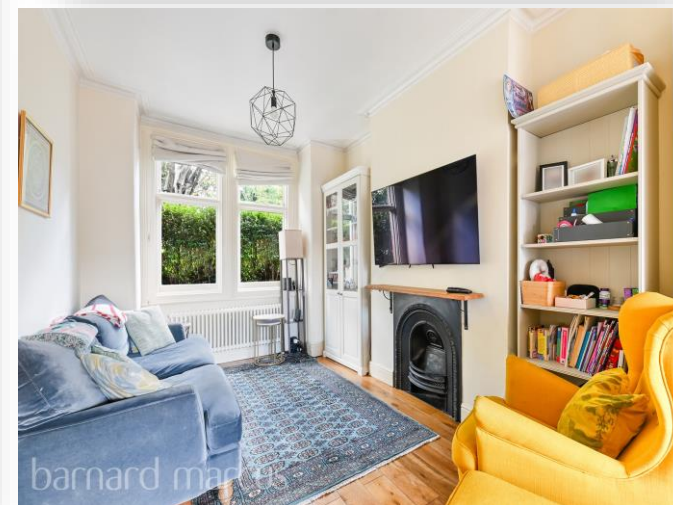
Wandle Bank, London SW19 1DW