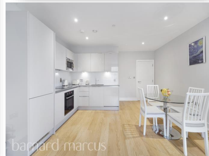
Keel Apartments, Greyhound Parade, London SW17 0GY