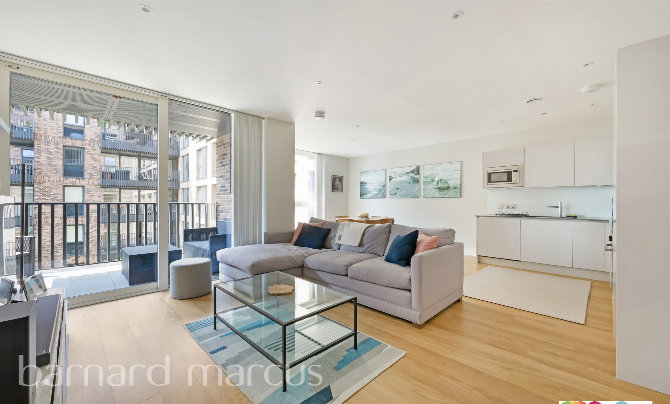
Lister House, Plough Lane, London SW17 0QU