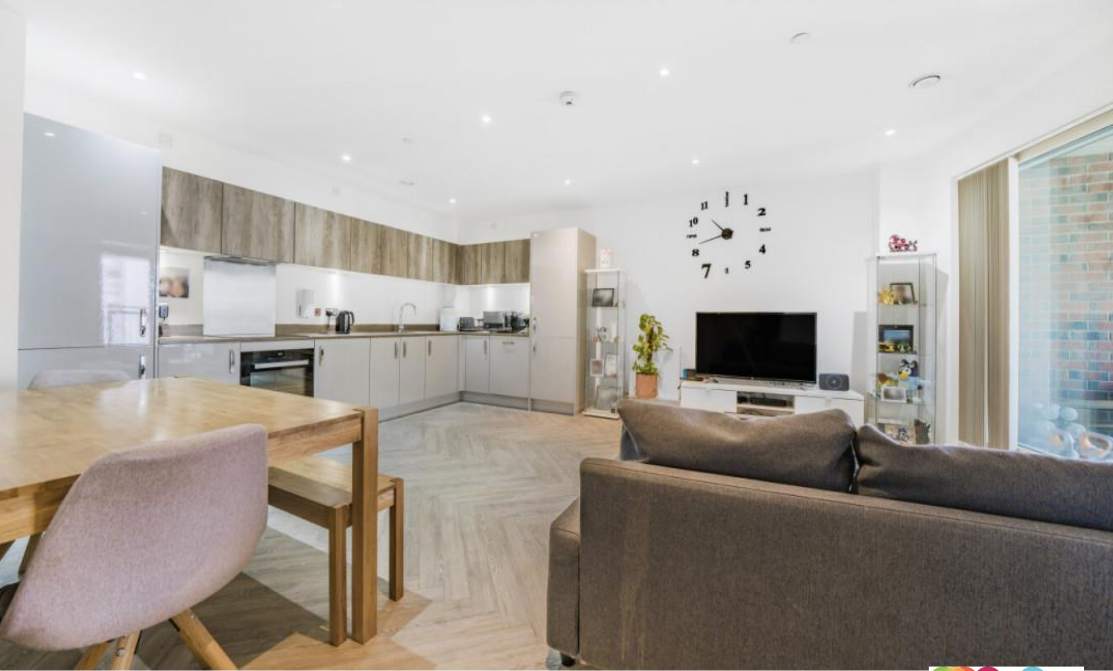
Herringbone Apartments, Courthouse Way, London SW18 4PF