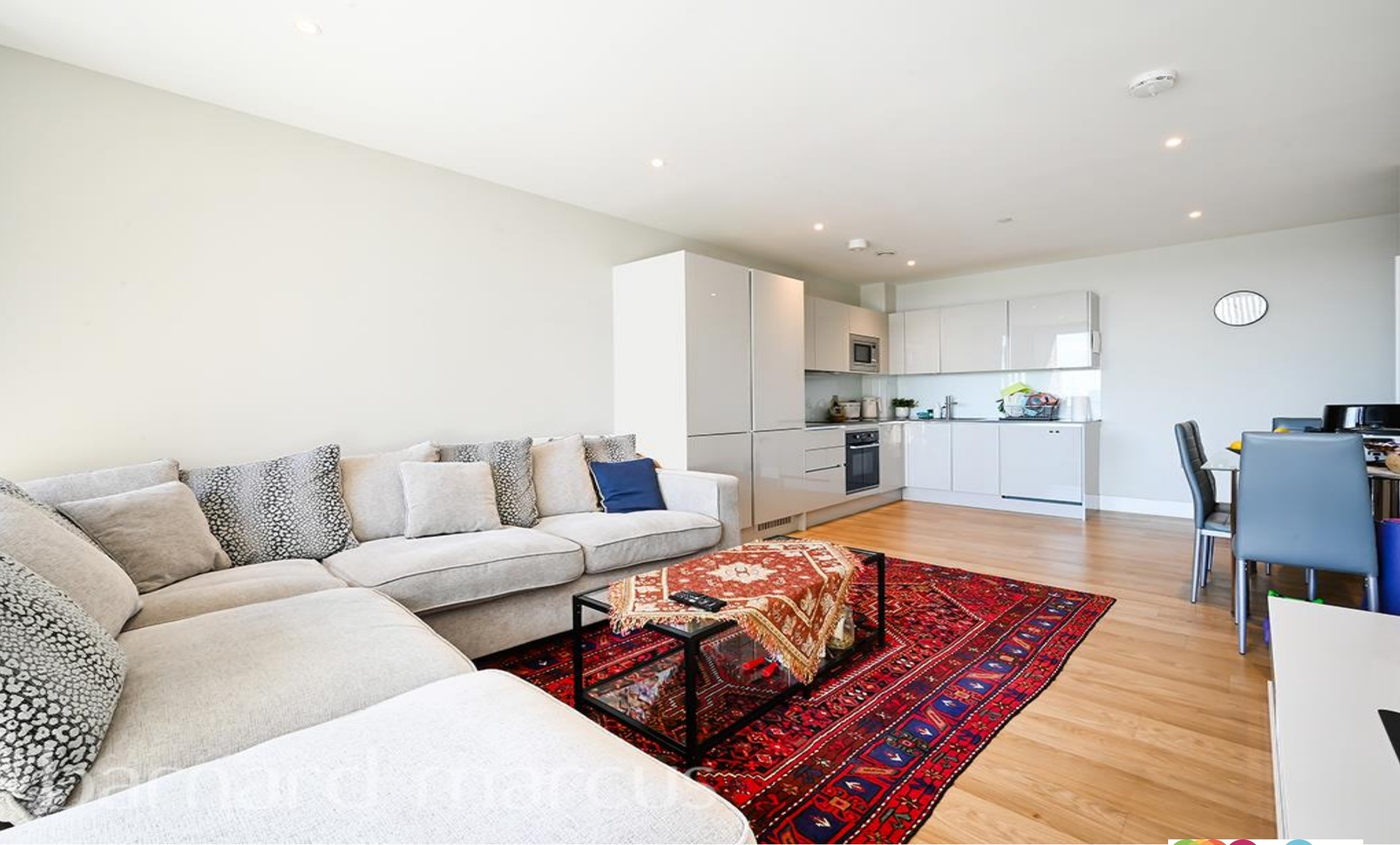
Lister House, Plough Lane, London SW17 0QU