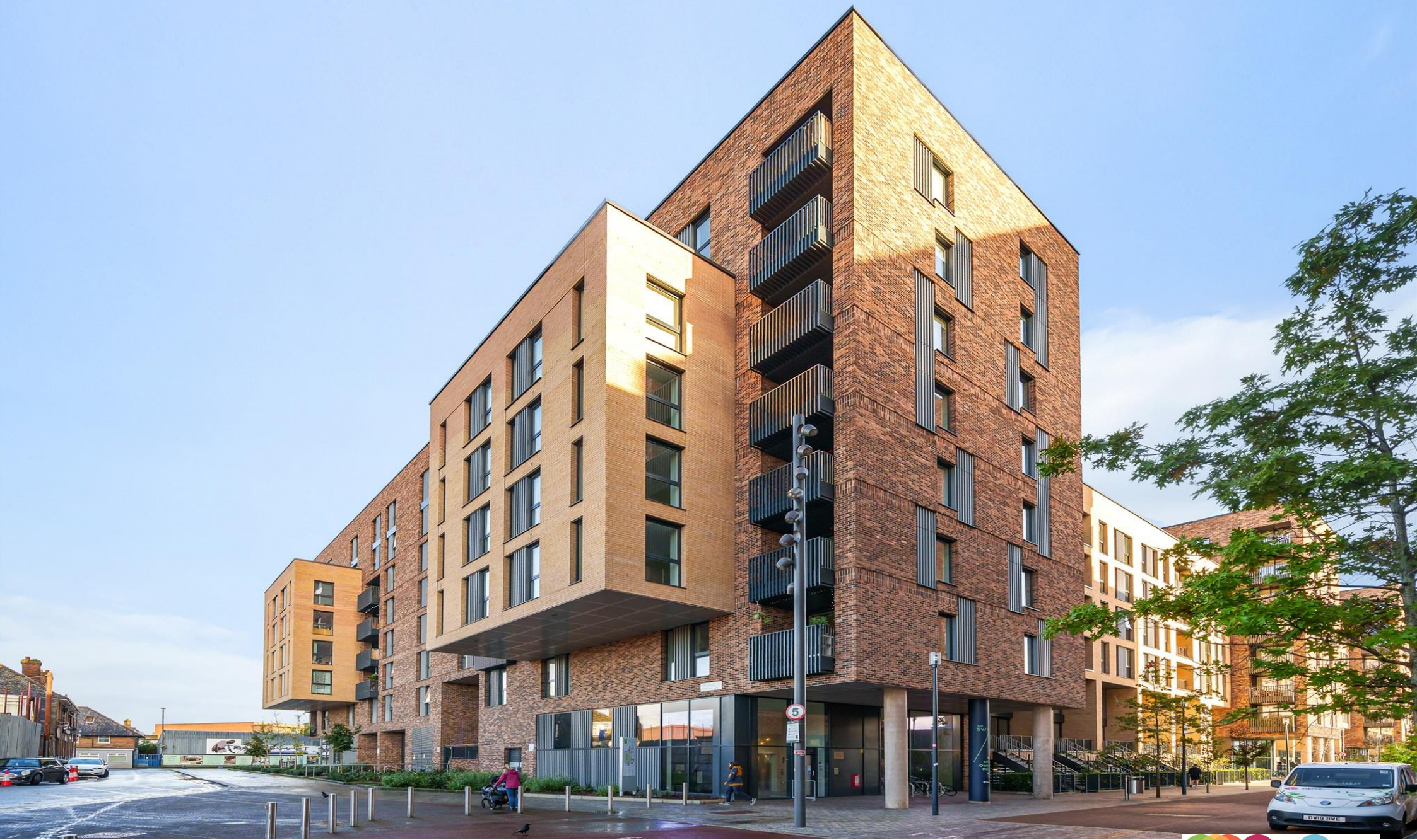
Keel Apartments, Greyhound Parade, London SW17 0GY