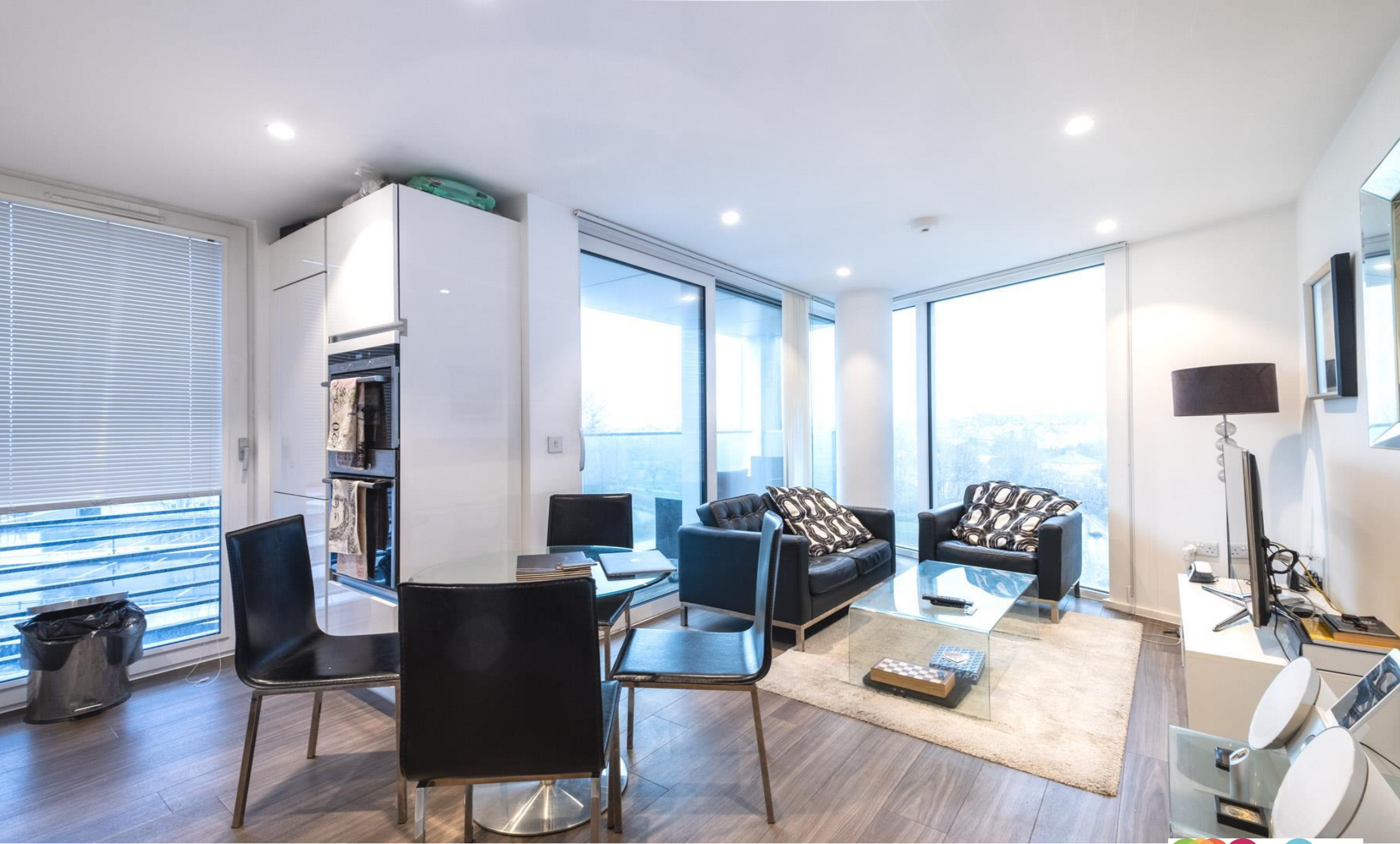
Aurora Apartments, Buckhold Road, London SW18 4FW