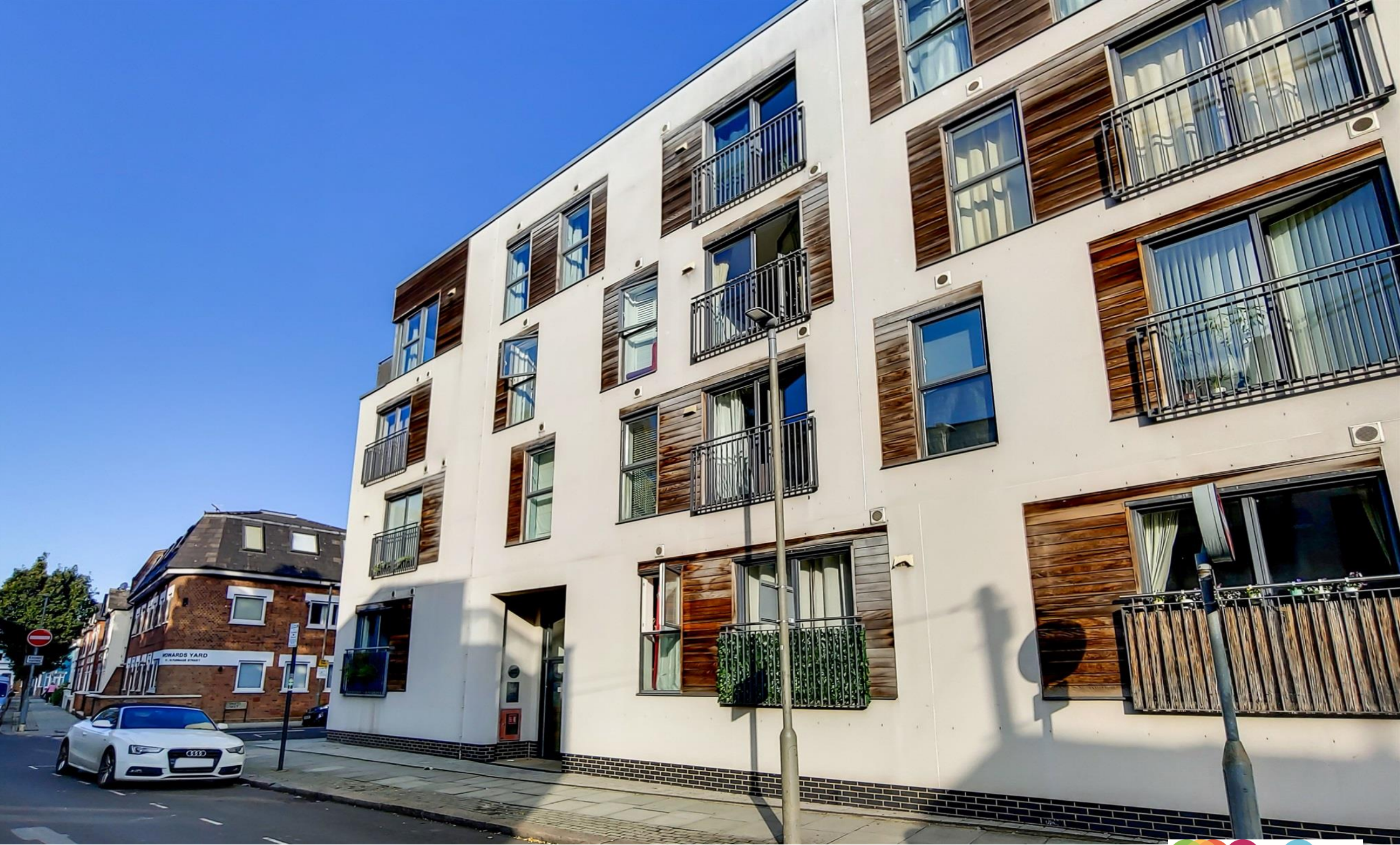
Hardy Court, Furmage Street, London SW18 4GH