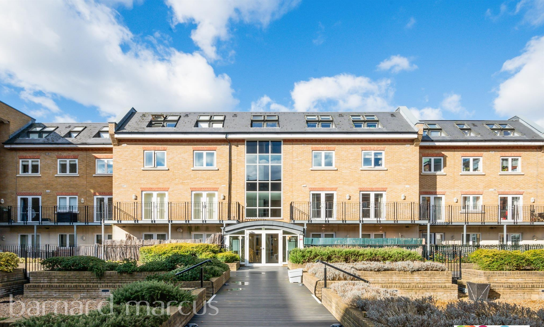
Voltaire Buildings, Garratt Lane, London SW18 4FQ