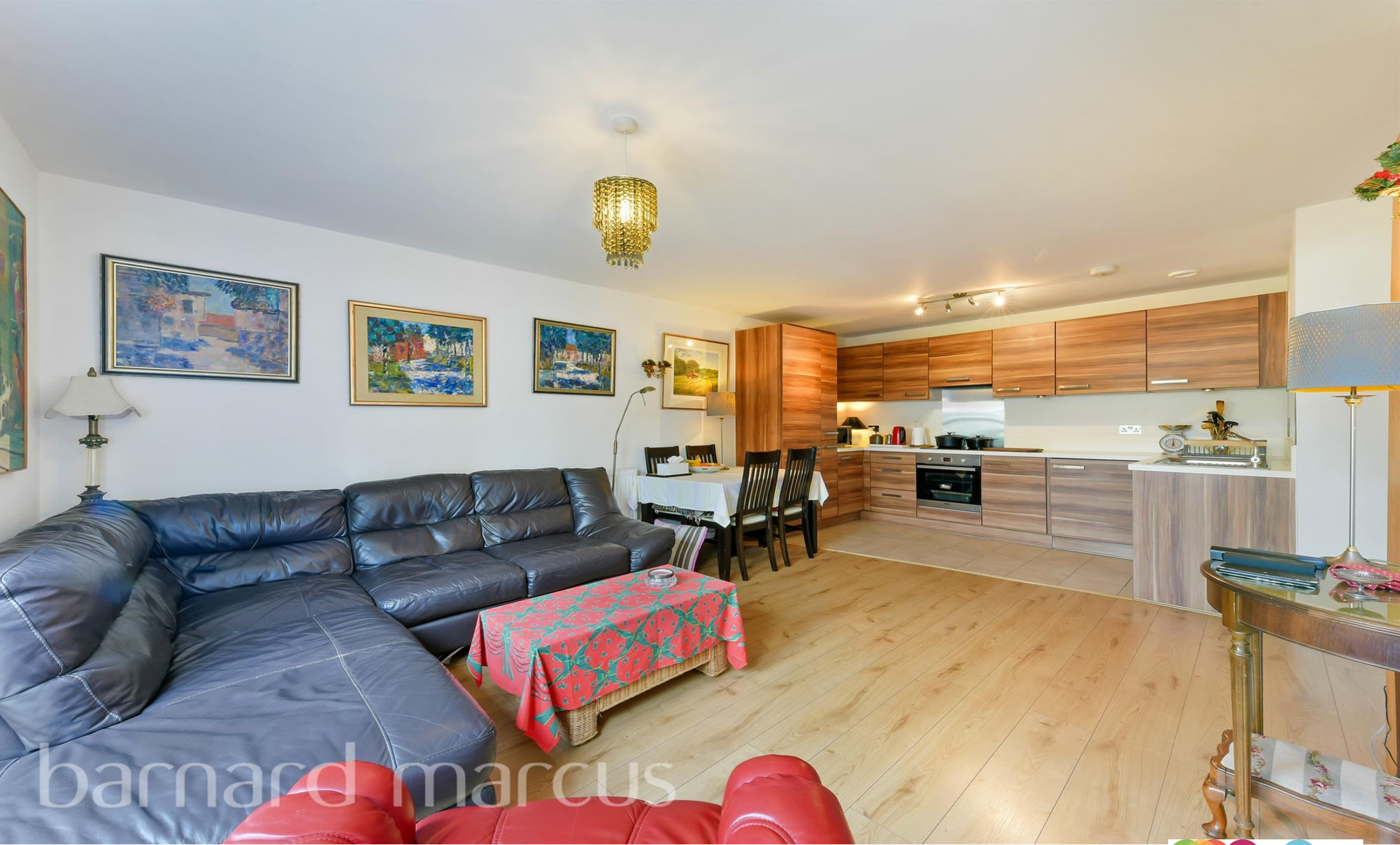
Ketley House, Garratt Lane, London SW18 4GR