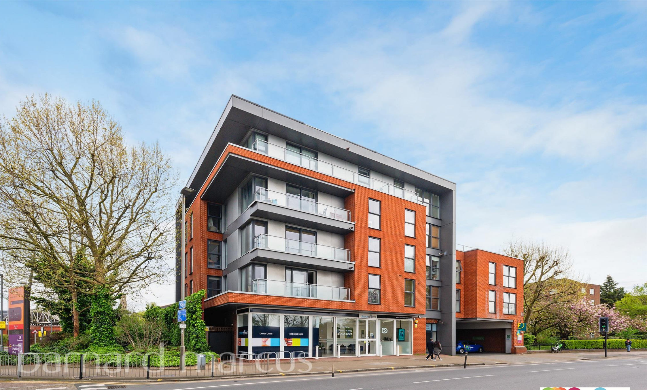
Ketley House, Garratt Lane, London SW18 4GR