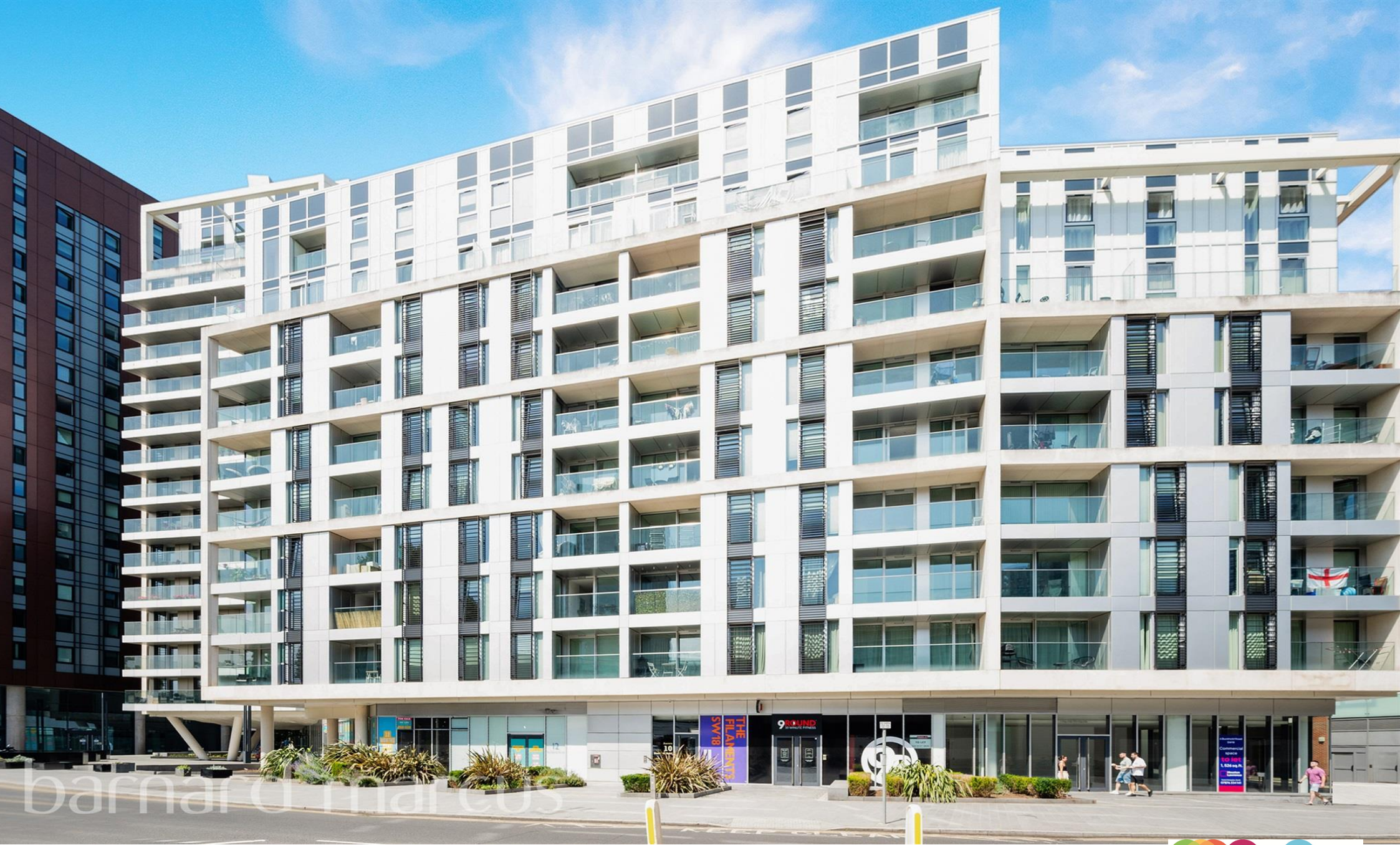
Aurora Apartments, Buckhold Road, London SW18 4FW