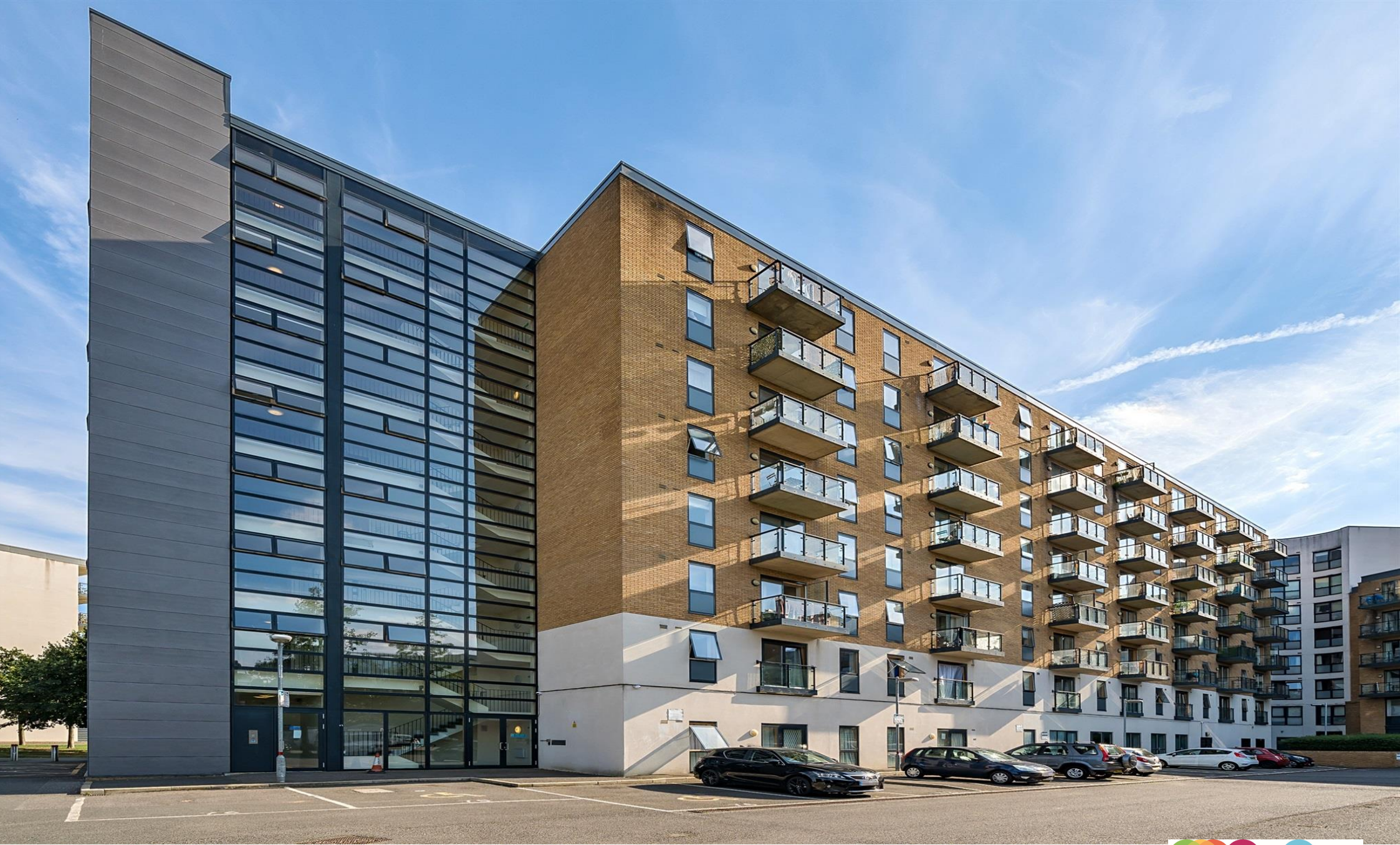
Reed House, Durnsford Road, London SW19 8GY