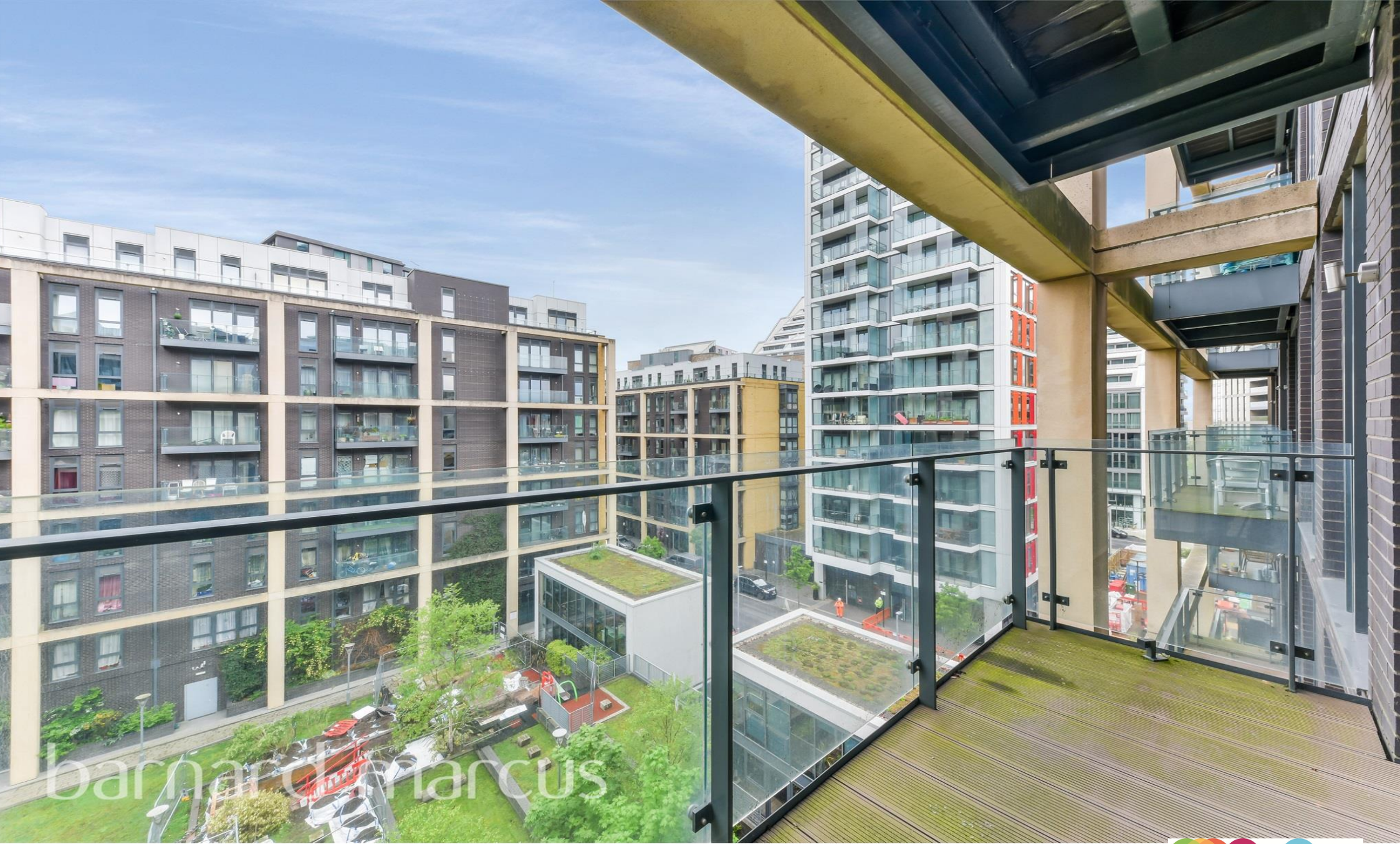
Kennet House, Enterprise Way, London SW18 1GF