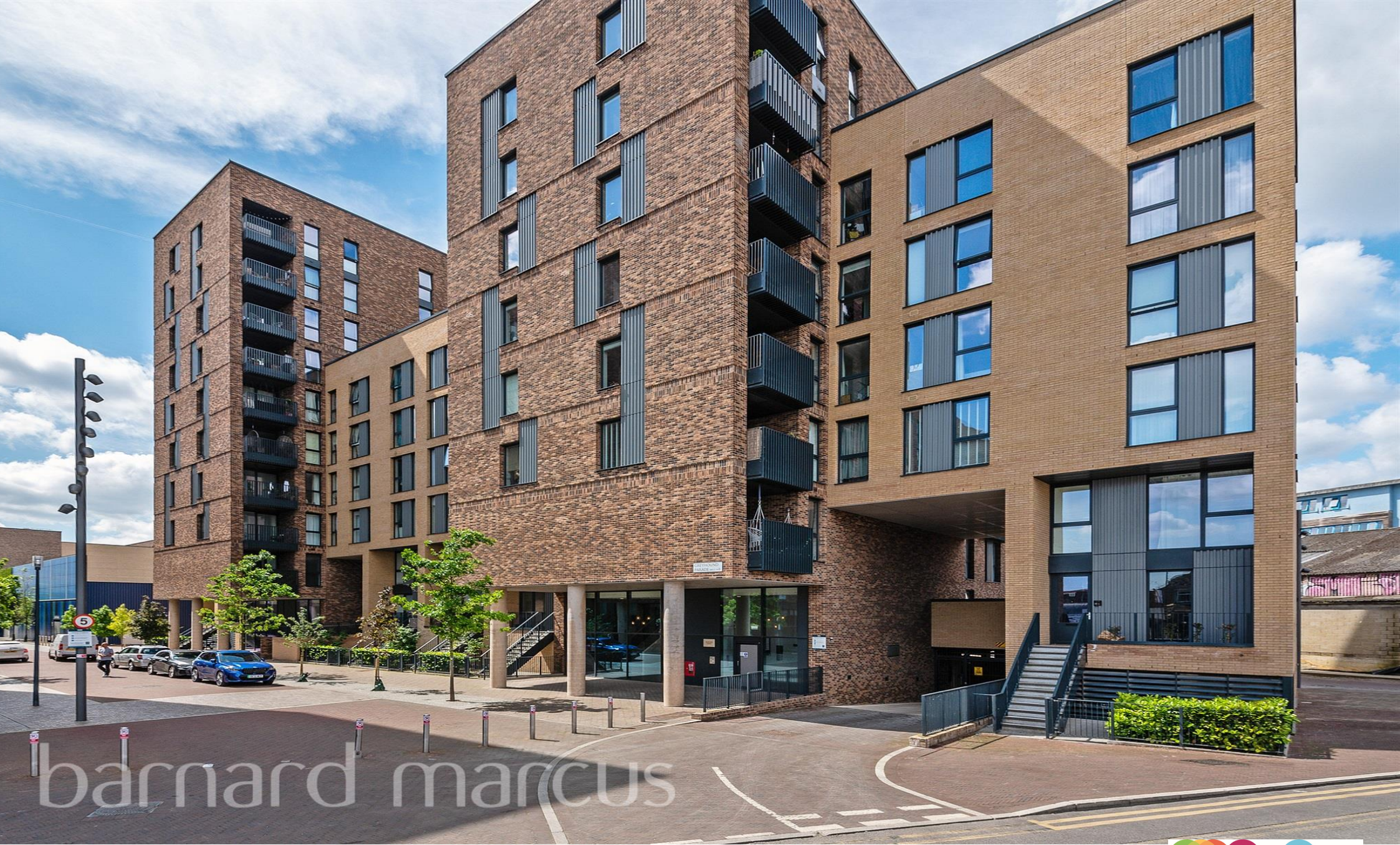
Millwards Court, Greyhound Parade, London SW17 0JQ