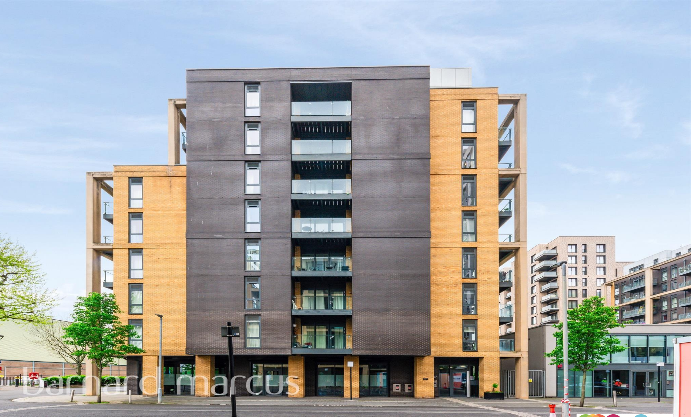
Kennet House, Enterprise Way, London SW18 1GF