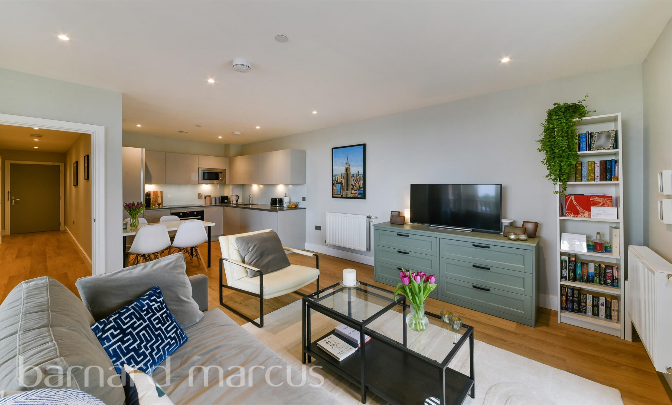
Bushane Court, Greyhound Parade, London SW17 0SJ