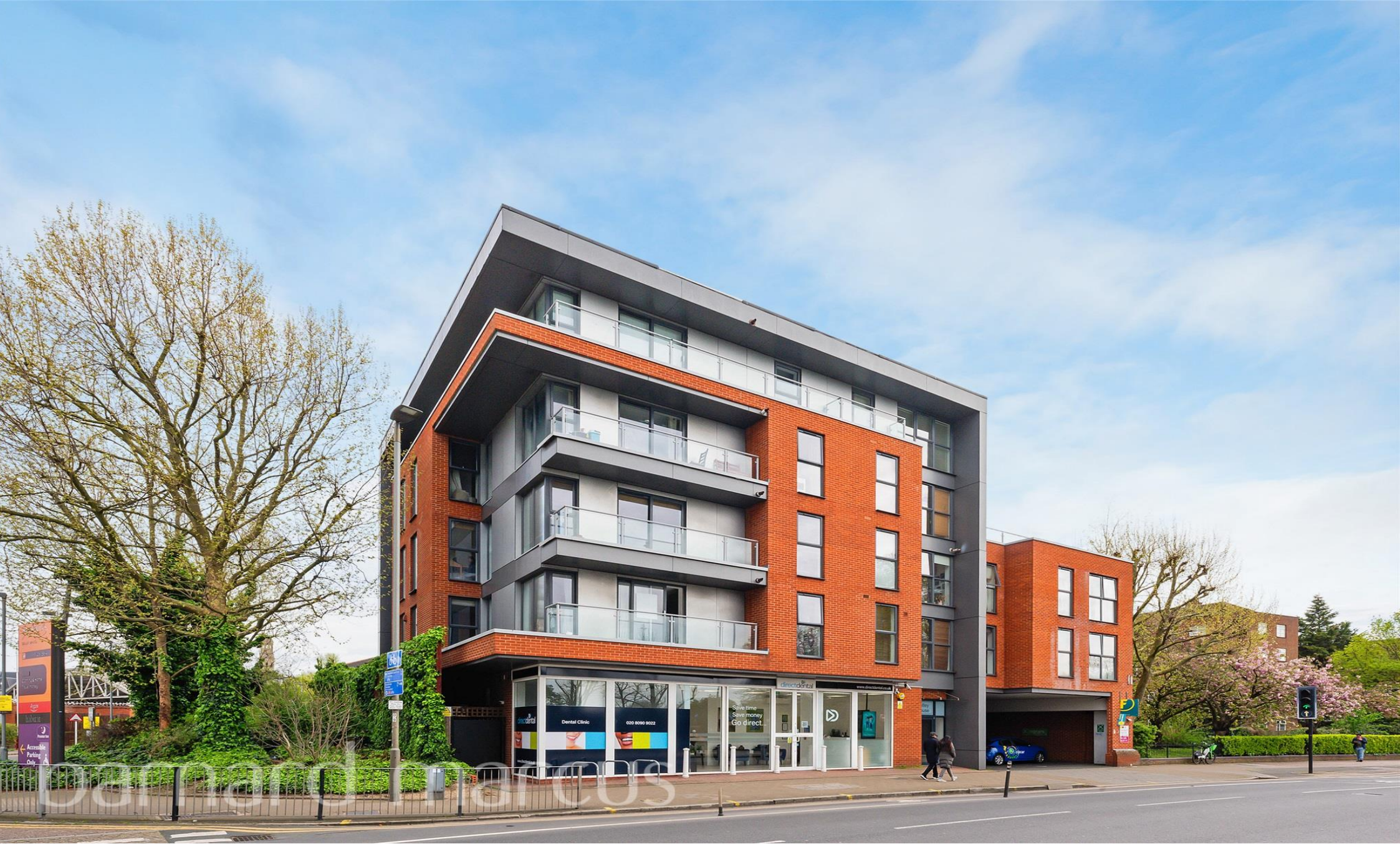
Ketley House, Garratt Lane, London SW18 4GR