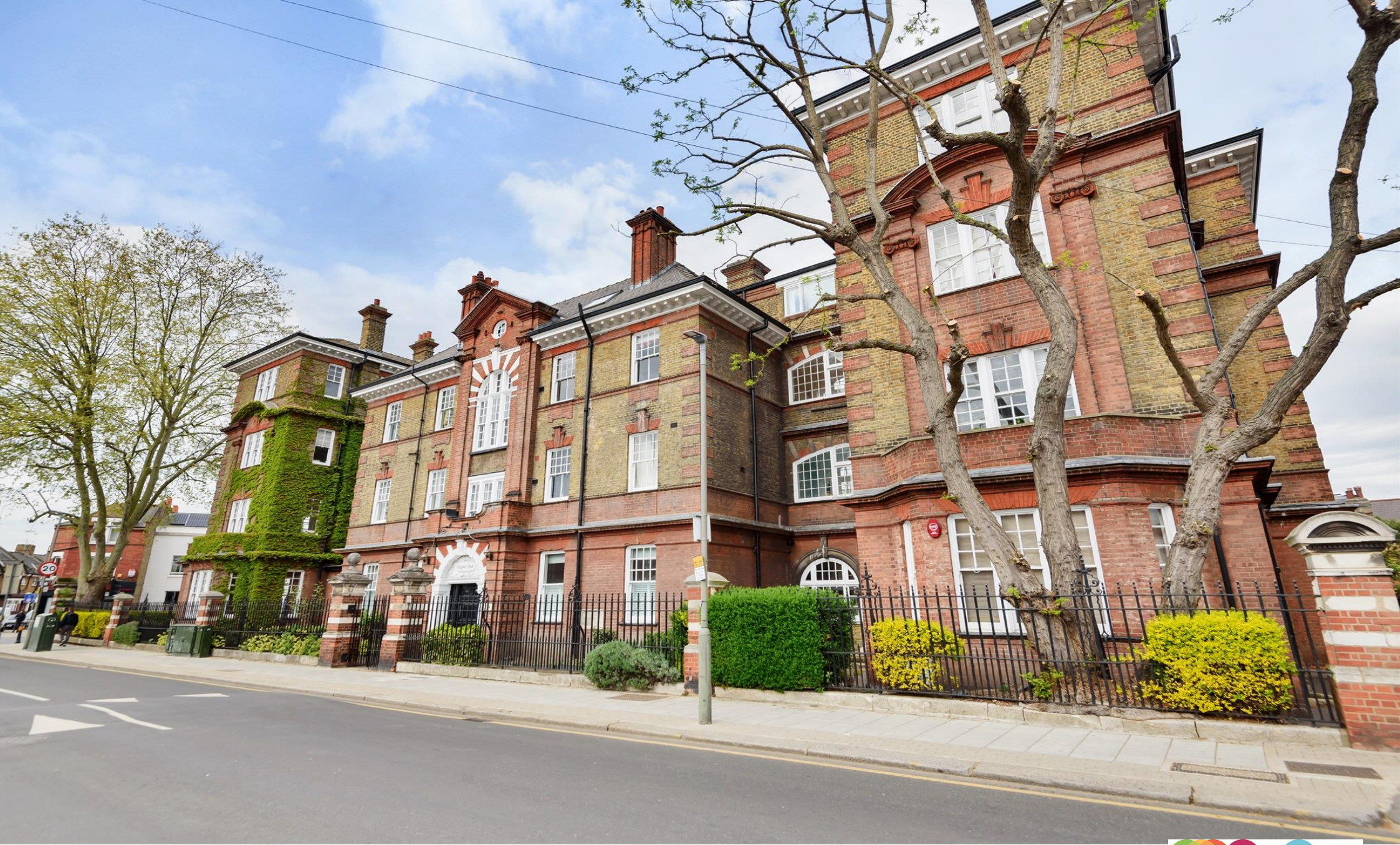
Earlsfield House, Swaffield Road, London SW18 3AH