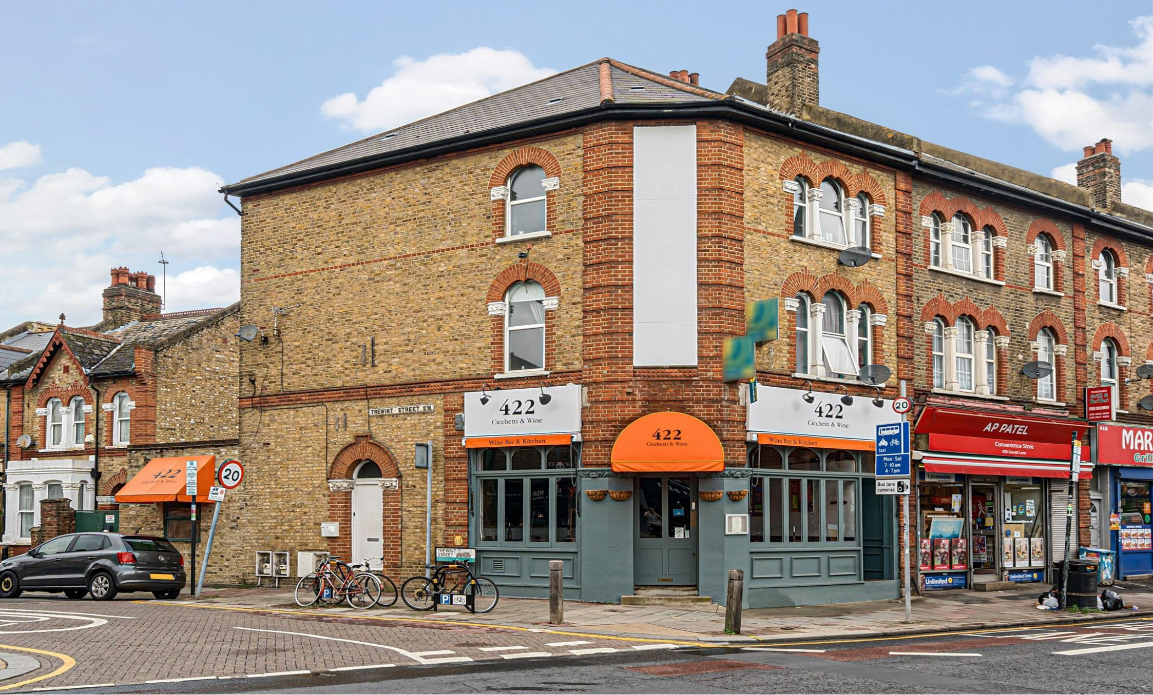
Garratt Lane, London SW18 4HW