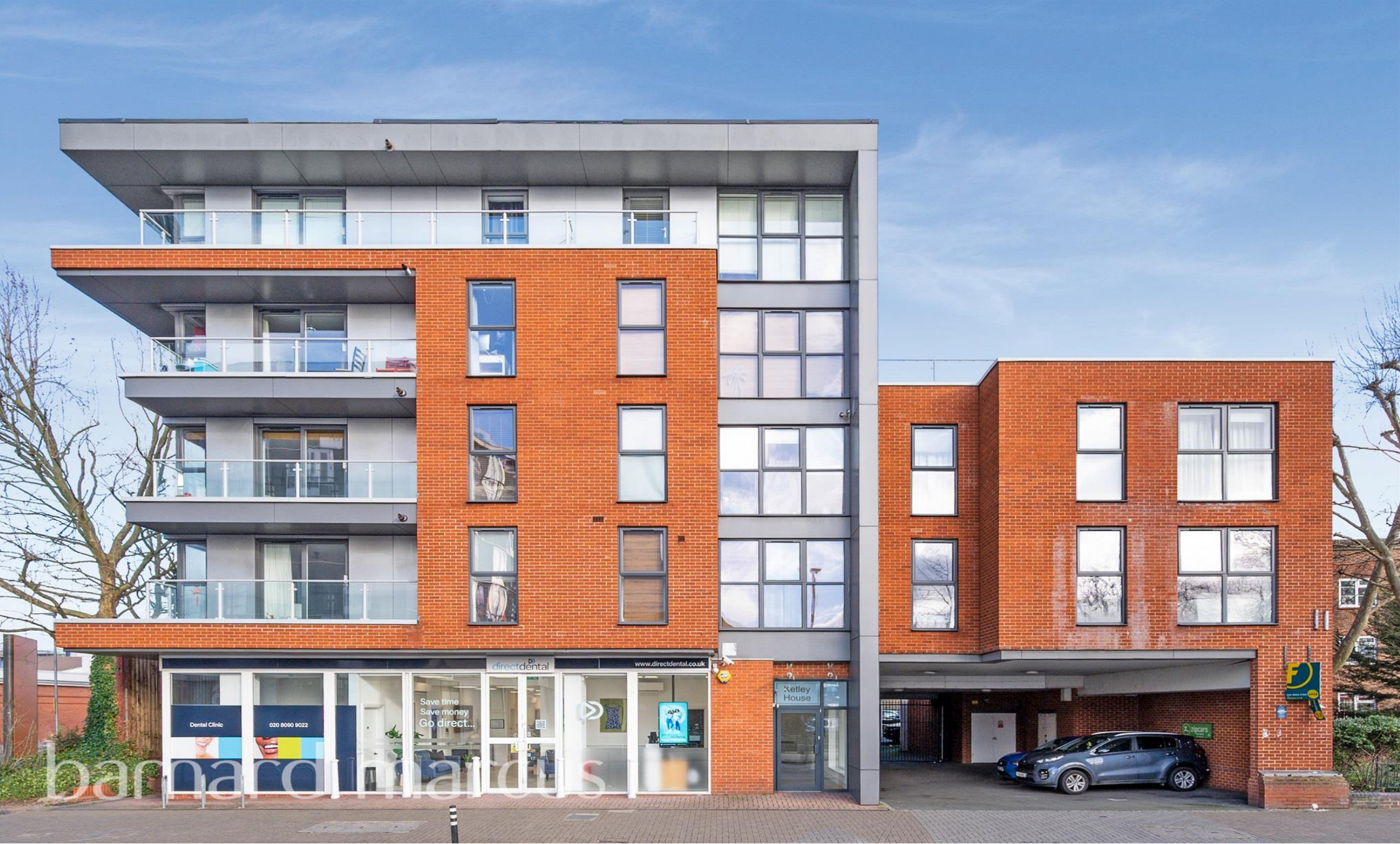
Ketley House, Garratt Lane, London SW18 4GR