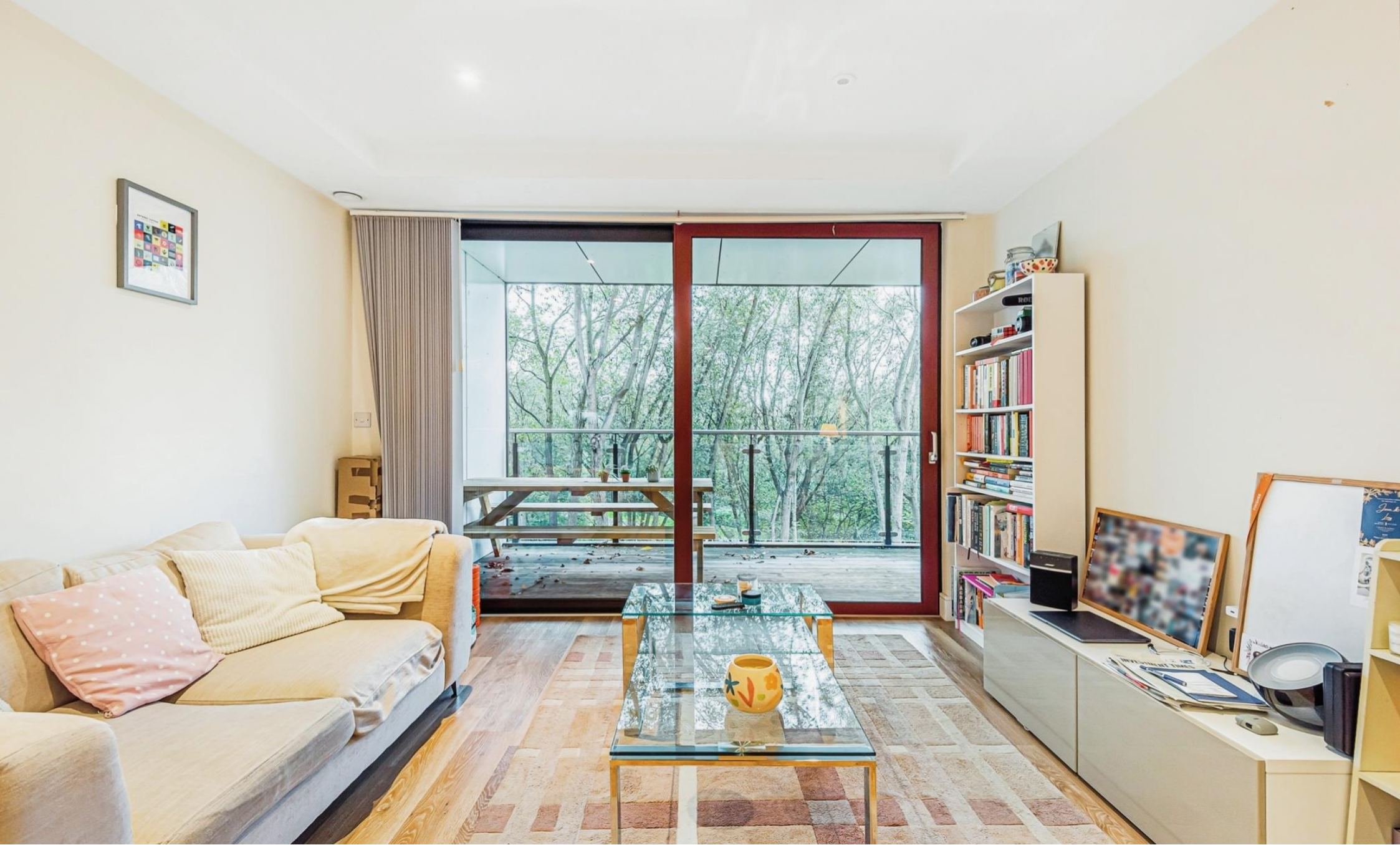
George View House, Knaresborough Drive, London SW18 4GT