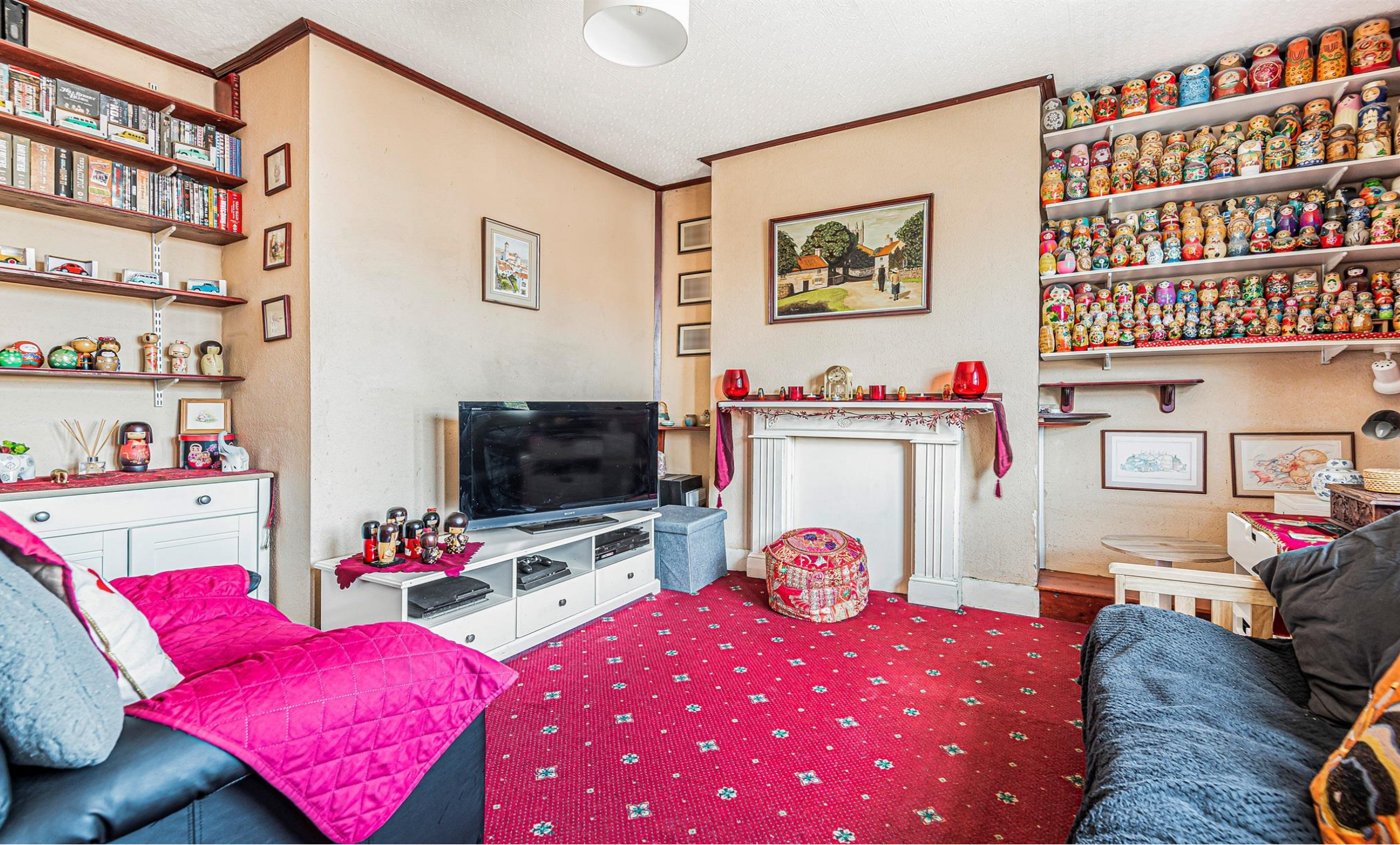
Garratt Lane, London SW18 4ES