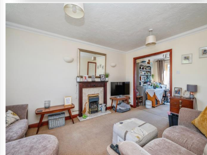
Starling Close, Aylsham, Norwich, NR11 6XG